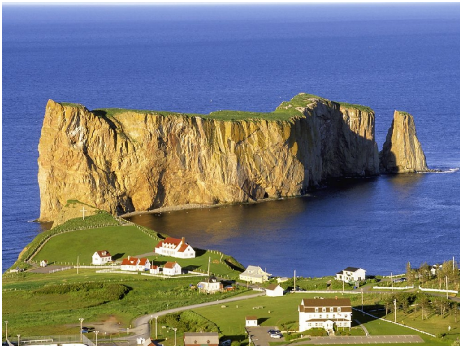
Percé Rock in the Gaspé.

Jul 15, 2020 • Last Updated 5 minutes ago • 1 minute read