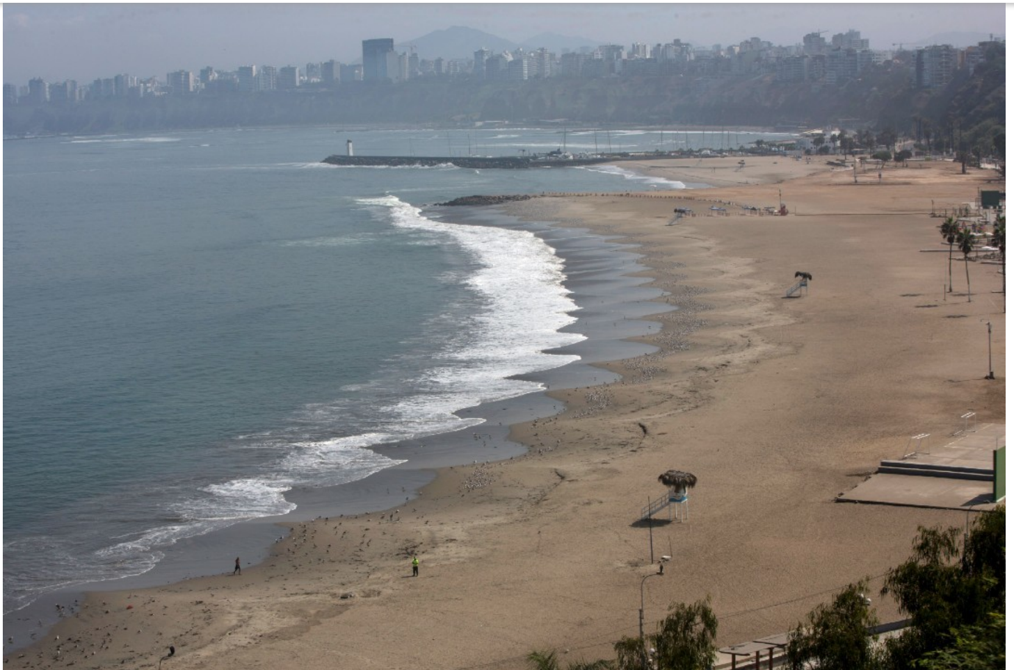
Agua Dulce beach on March 21, after coronavirus restrictions were enacted.

By continuing to use our site, you agree to our Terms of Service and Privacy Policy . You can learn more about how we use cookies by reviewing our Privacy Policy .