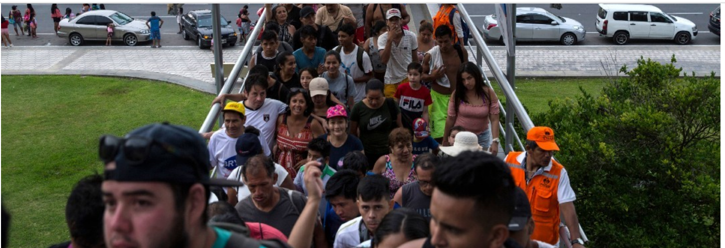
The crowded pedestrian bridge that leads to and from Agua Dulce beach on Feb. 16.

By continuing to use our site, you agree to our Terms of Service and Privacy Policy . You can learn more about how we use cookies by