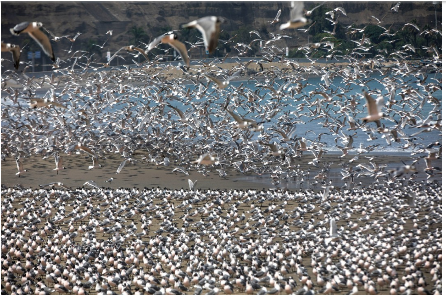
Birds descend on Agua Dulce beach on March 24.

By continuing to use our site, you agree to our Terms of Service and Privacy Policy . You can learn more about how we use cookies by reviewing our Privacy Policy .