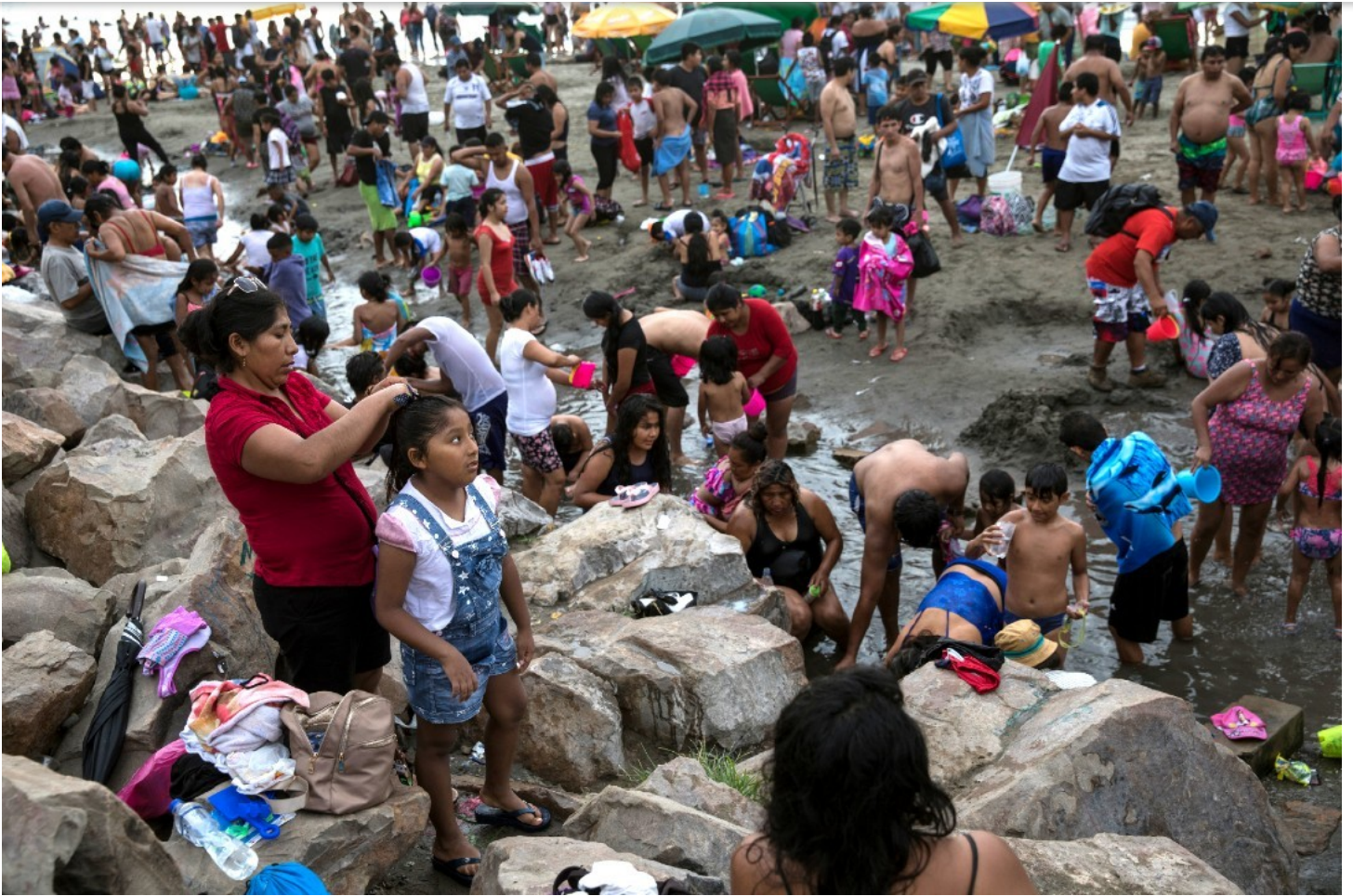
Beachgoers at the Lima beach on Feb. 23.