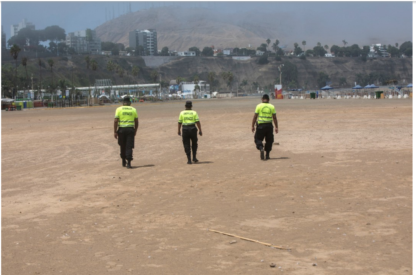
Police walk along the Lima beach to warn off would-be swimmers on March 24.

By continuing to use our site, you agree to our Terms of Service and Privacy Policy . You can learn more about how we use cookies by reviewing our Privacy Policy .