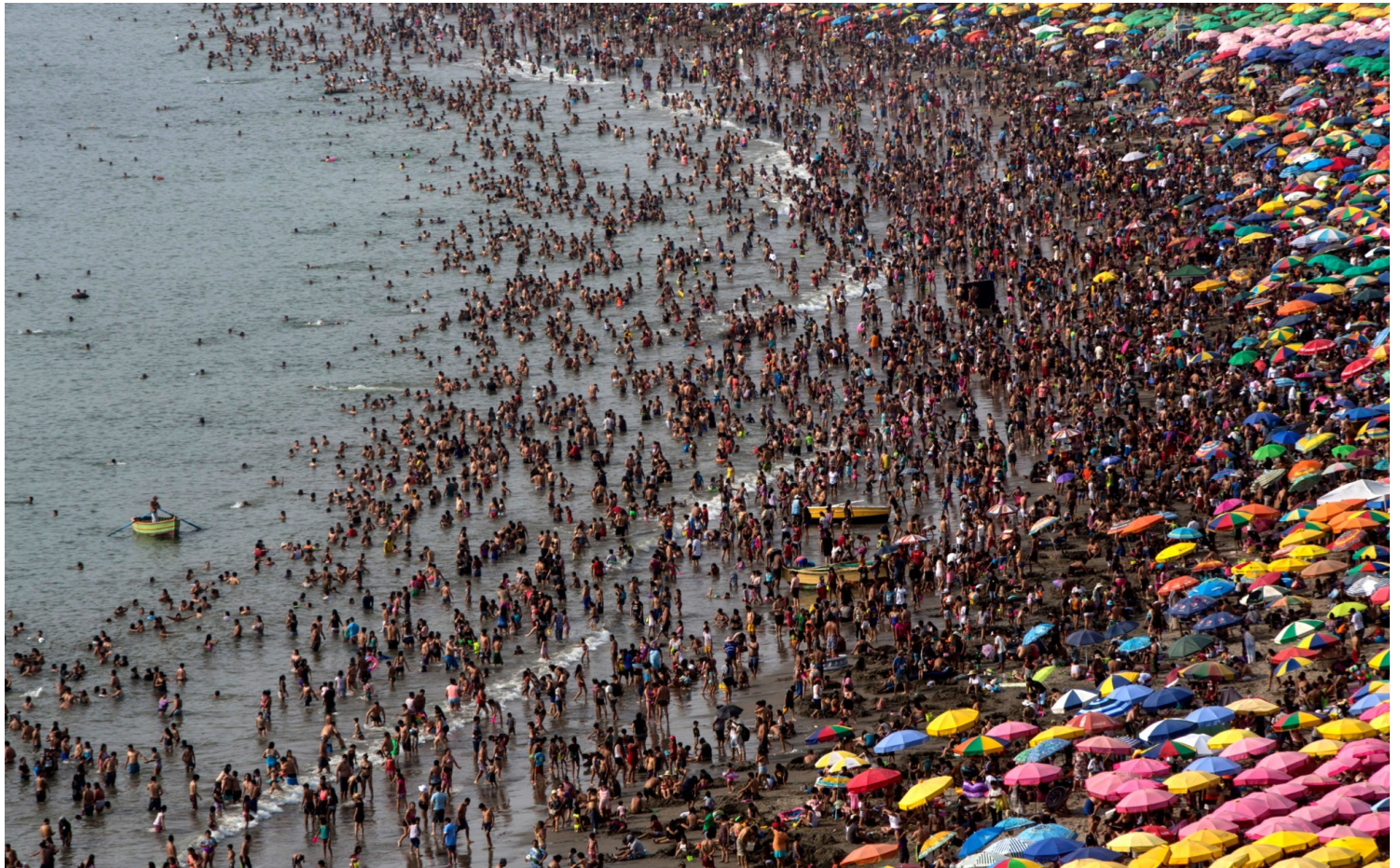
The Agua Dulce public beach in Lima, Peru, on Feb. 16.