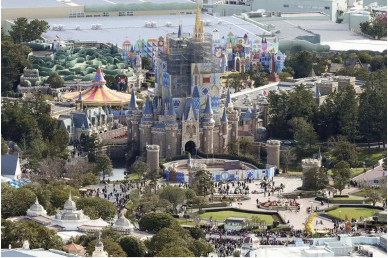
After lockdown due to Coronavirus: