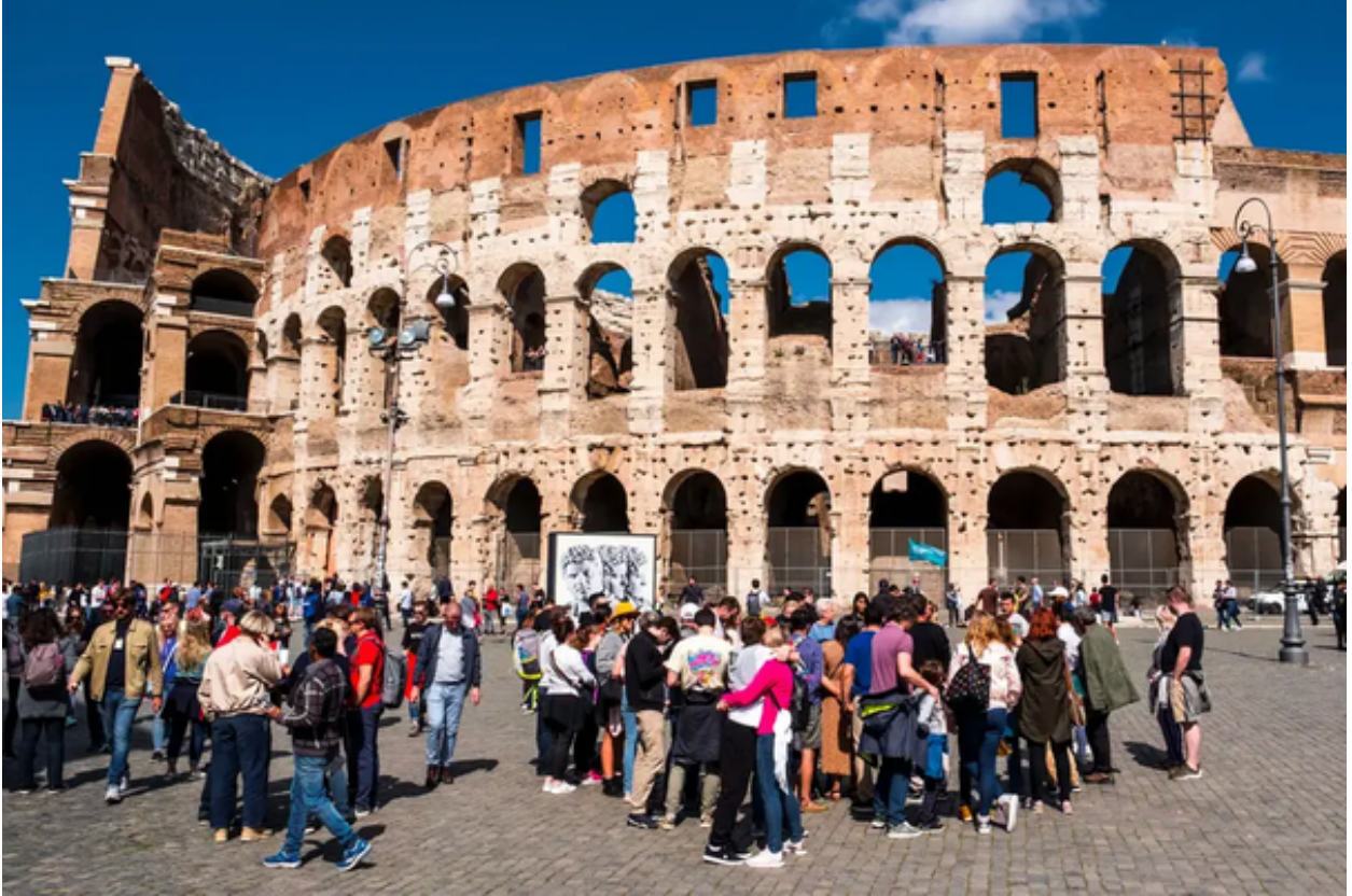
The Colosseum recently: