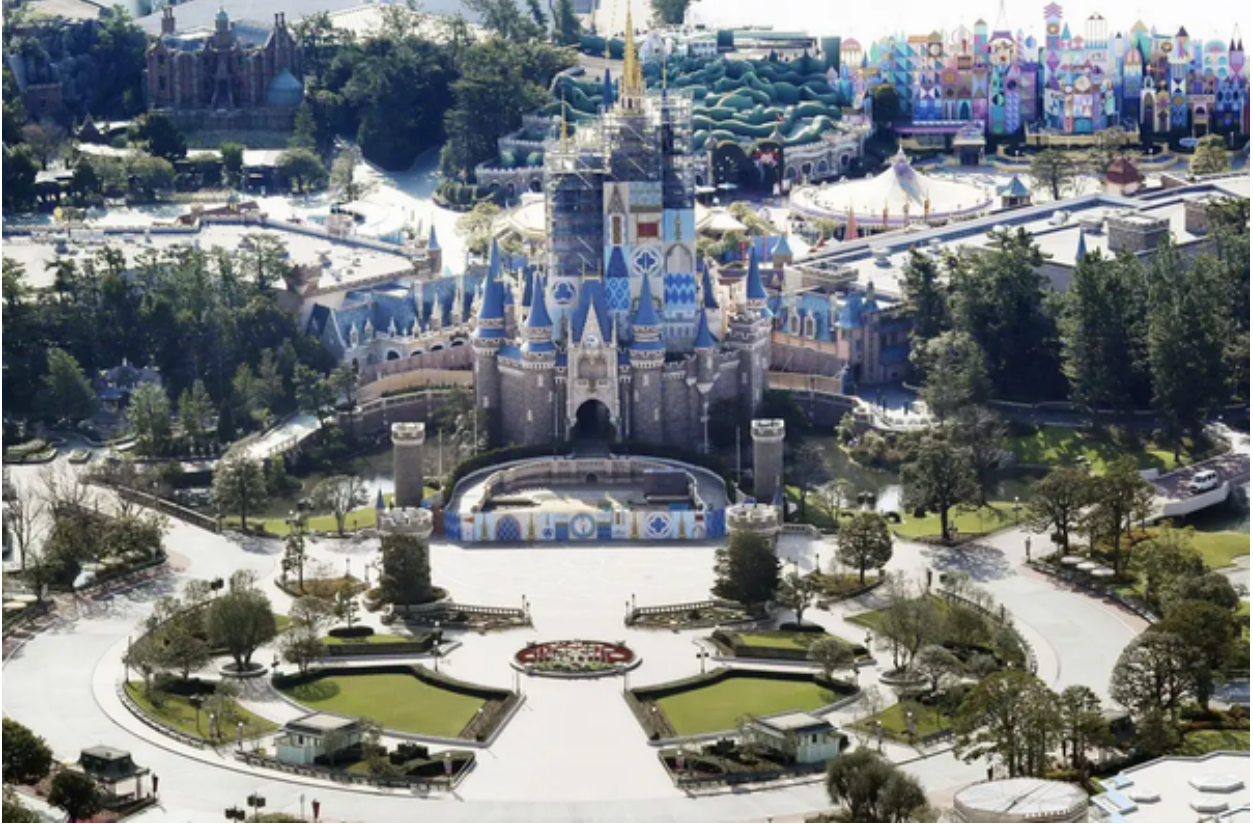
Other photos of famous places - before and after Coronavirus lockdown :