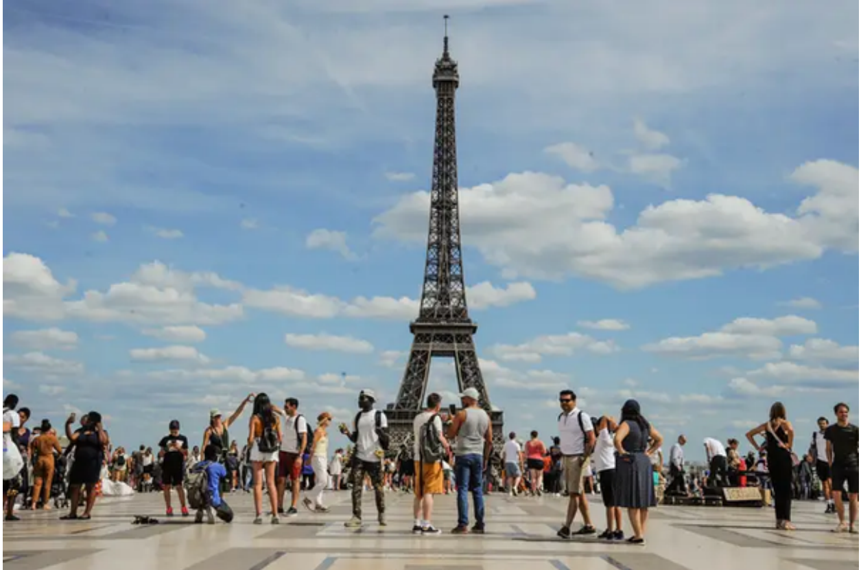
After the Coronavirus lockdown: