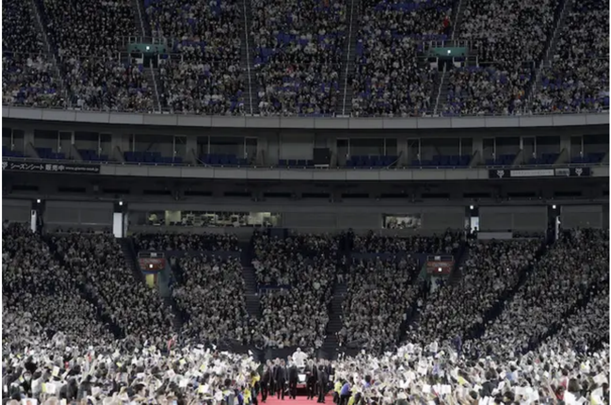
After the lockdown: