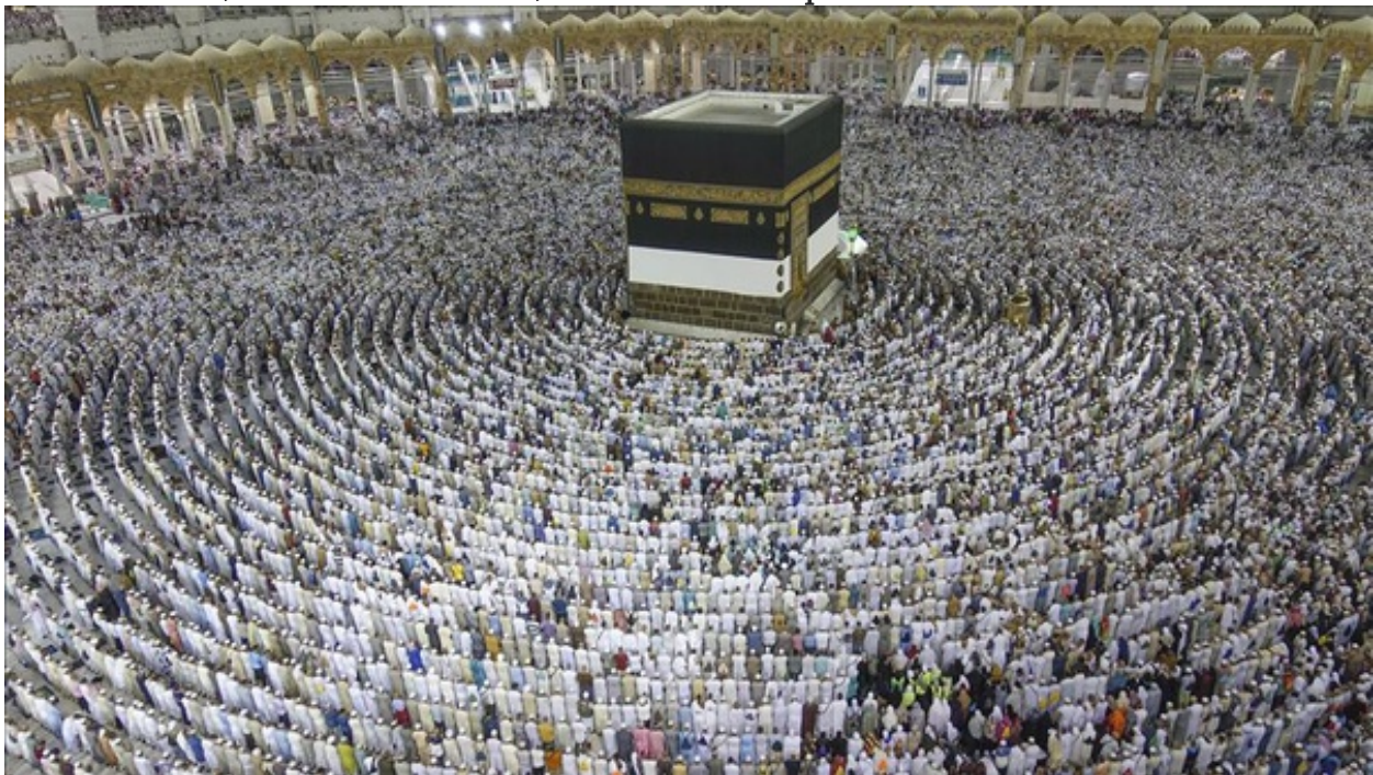
The Kaaba on March 2020: