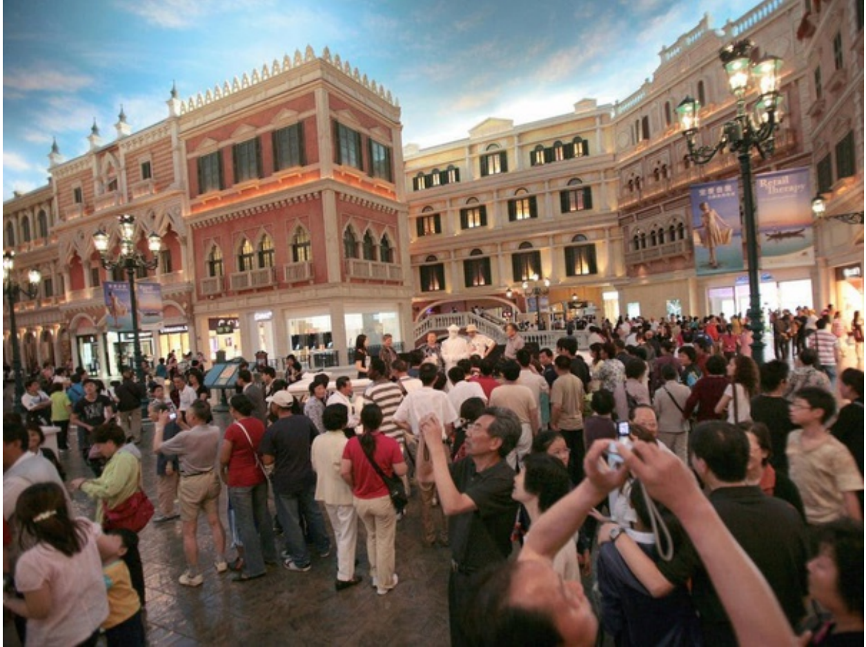
After lockdown :