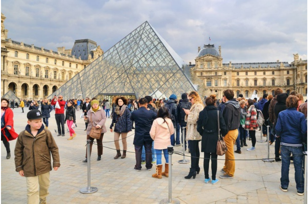
After 1st March 2020, the Museum has been closed from the public: