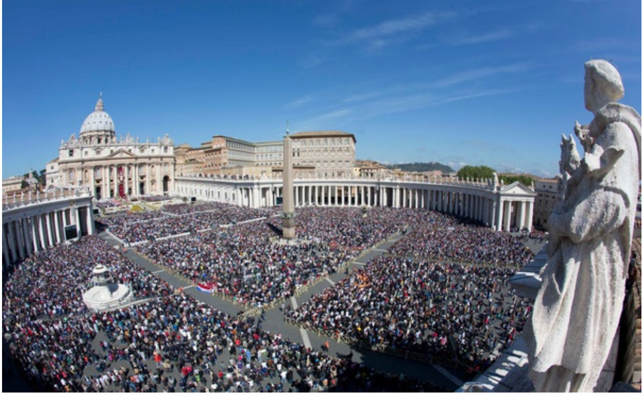
Saint Peter's Square today: