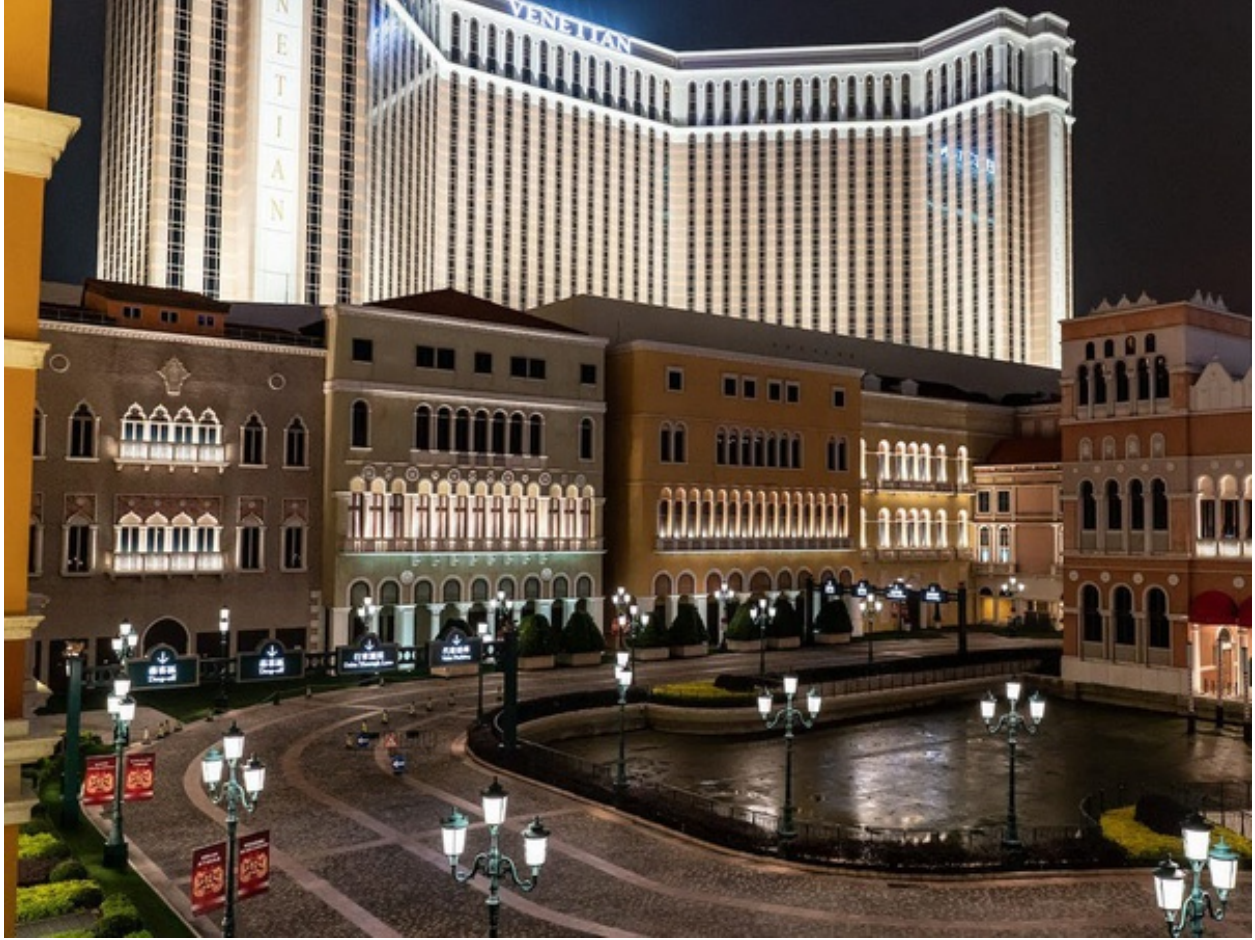
13. Before the lockdown: