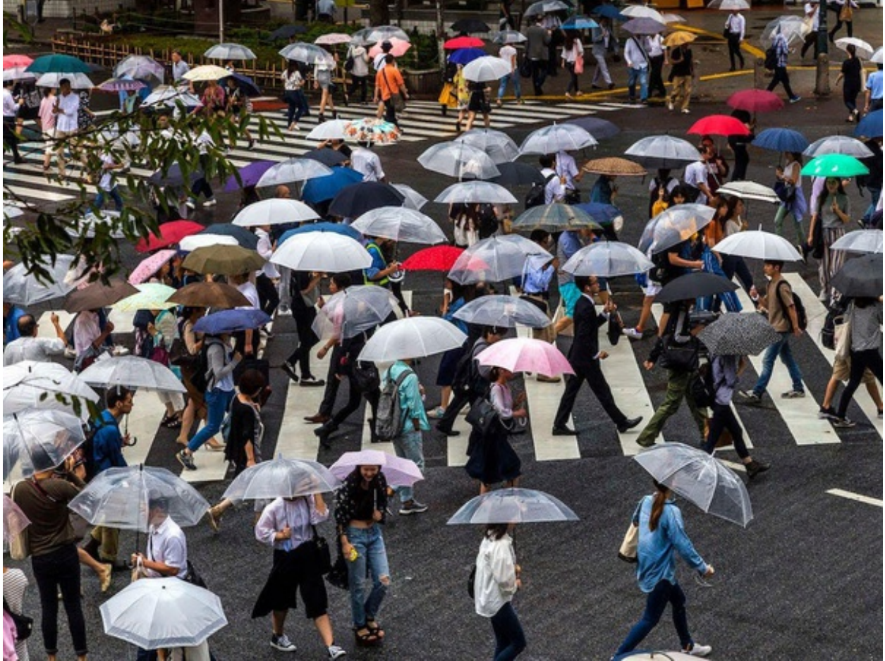
After the lockdown: