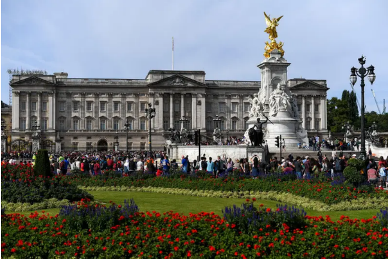
After the the lockdown has been issued :