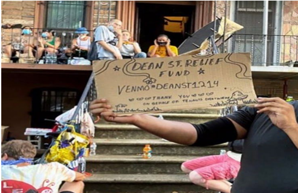
Dean St. tenants Venmo payment fund to support their move out.