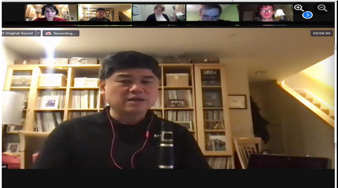
Everything was online during 2020-21, from lessons to masterclasses and more.