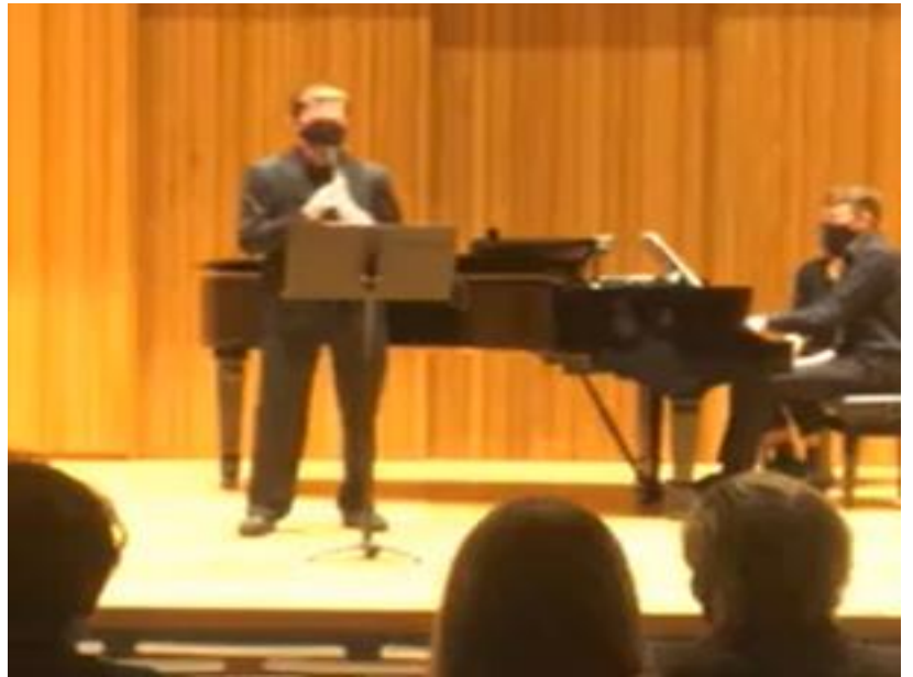
Junior Recital, playing with mask on.

Me and an old friend of mine post-concert, for which we had to where masks while playing.