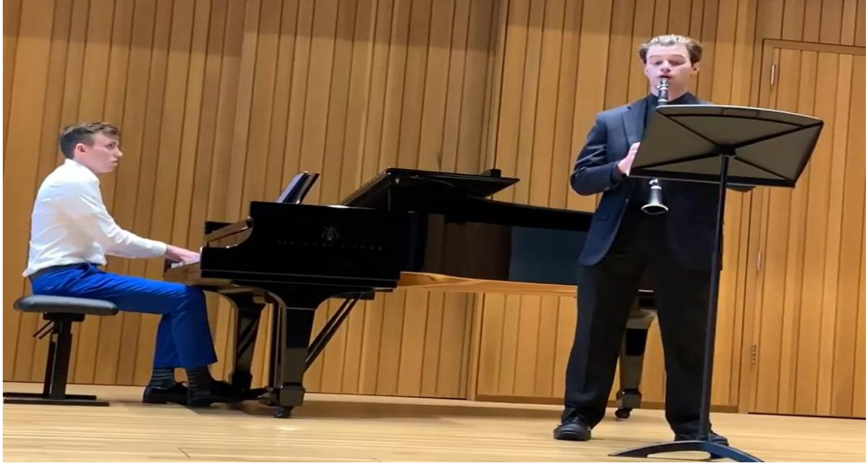
My Senior Recital a couple weeks ago. The mask mandate was finally, FINALLY lifted.