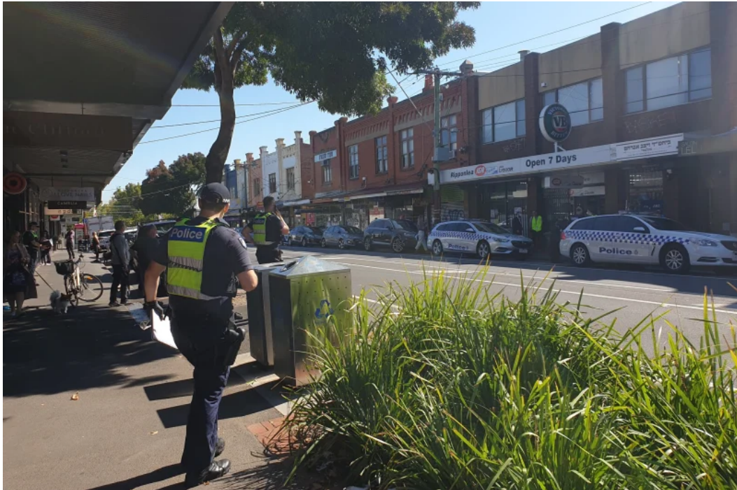
The scene at Ripponlea

They fined the group's leader $1652 for failing to adhere to directives designed to slow the spread of coronavirus. Police are working to ascertain the identities of the other attendees before determining whether more fines will be issued.