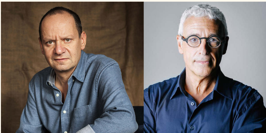
Photo: Philippe Sands and Mark Raphael Baker

We love to talk books in a city that loves to read them