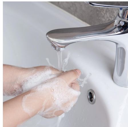
PREVENTION & TREATMENT