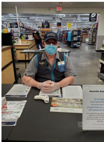
Walmart Associate Checks Coworker's Temperatures

Not all jobs can be done from home. For the over 26 million Americans working in the service industry, masks, physical distancing, and panic-buying are a part of the daily routine, and without them the general public would lack access to food, clothing, and household essentials. 1 Due to the pandemic, service industry workers have been facing more aggression from customers than ever before, and the instability of the job market has forced them into withstanding high levels of risk and discomfort in order to remain employed.