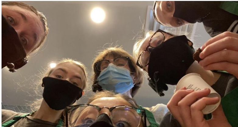
Keep Calm and Coffee On

It is unreasonable for this kind of experience to become commonplace. Working in this industry should not be a threat to physical, economic, and emotional health, especially not at the hands of customers. Next time you interact with a service industry employee, keep in mind the experience of those serving you; a little kindness can go a long way.