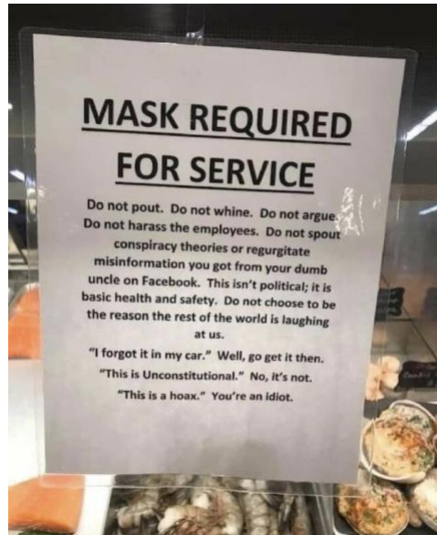
Mask Required For Service.

Beyond the initial struggles of the service industry, there are also projections that it will take up to four years for the industry to recover from the pandemic, at which point they would be able to afford hiring at fuller capacity. 3 This lack of stability brings additional fear and anxiety to those who depend on these jobs.