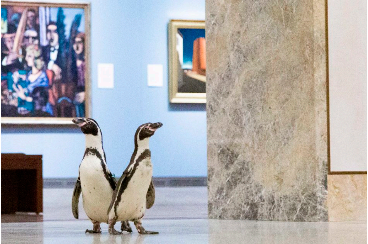
TOPICS: ANIMALS , CULTURE , PENGUINS