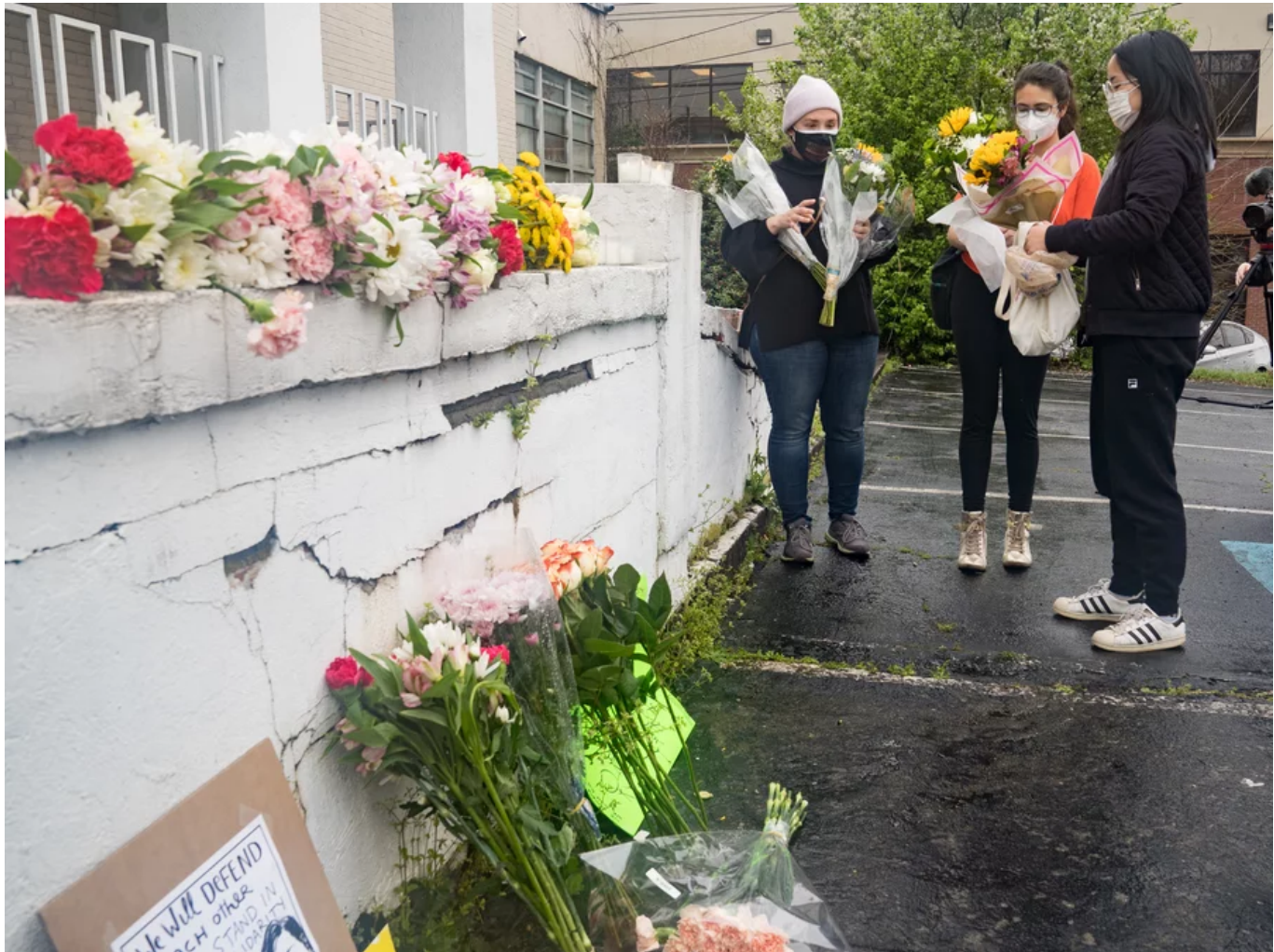
Mourners visit and leave flowers on Wednesday at the site of two shootings at spas across the street from one another in Atlanta.