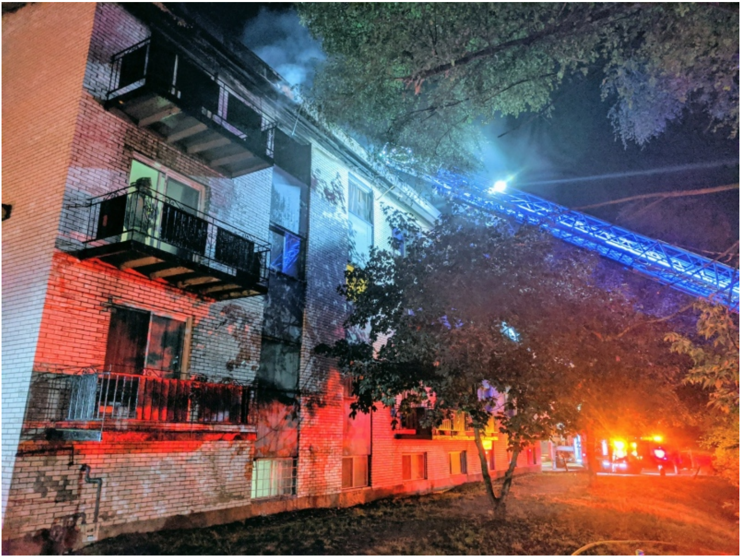
One person in critical condition after fire in Vanier