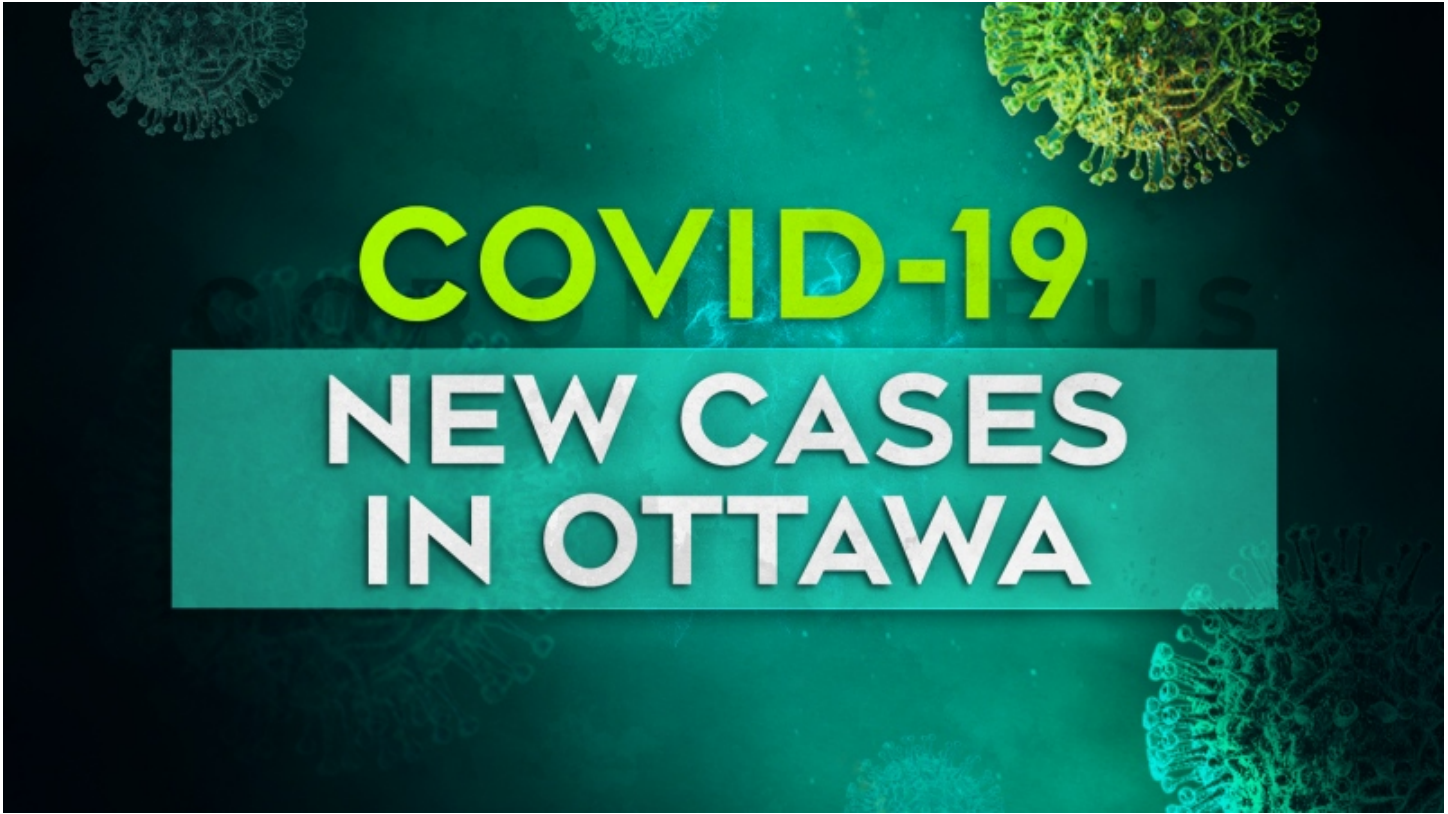
Eight new cases of COVID-19 in Ottawa