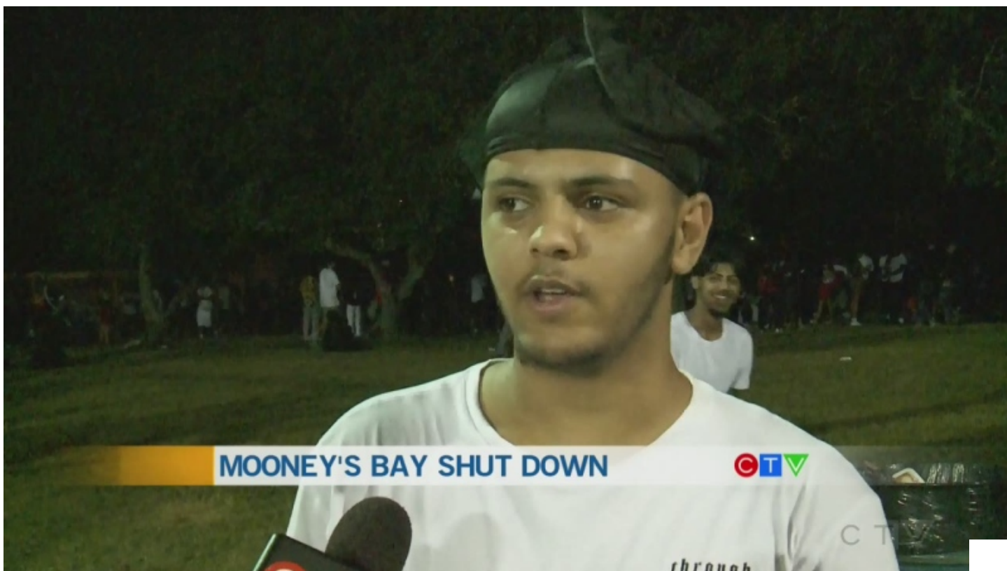
Morning Update: Police Shutdown Mooney's Bay Gathering