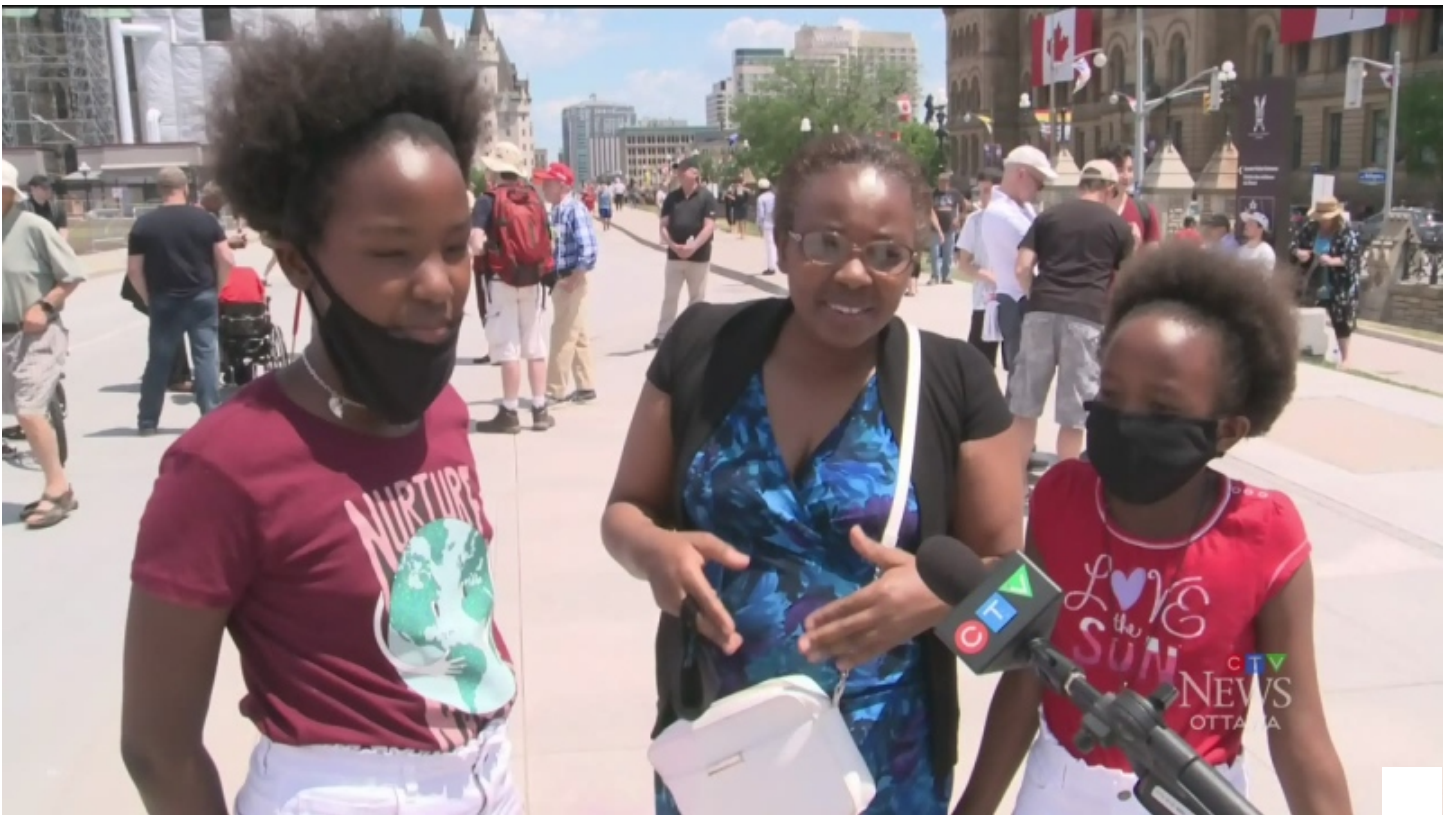
Canada Day during a pandemic