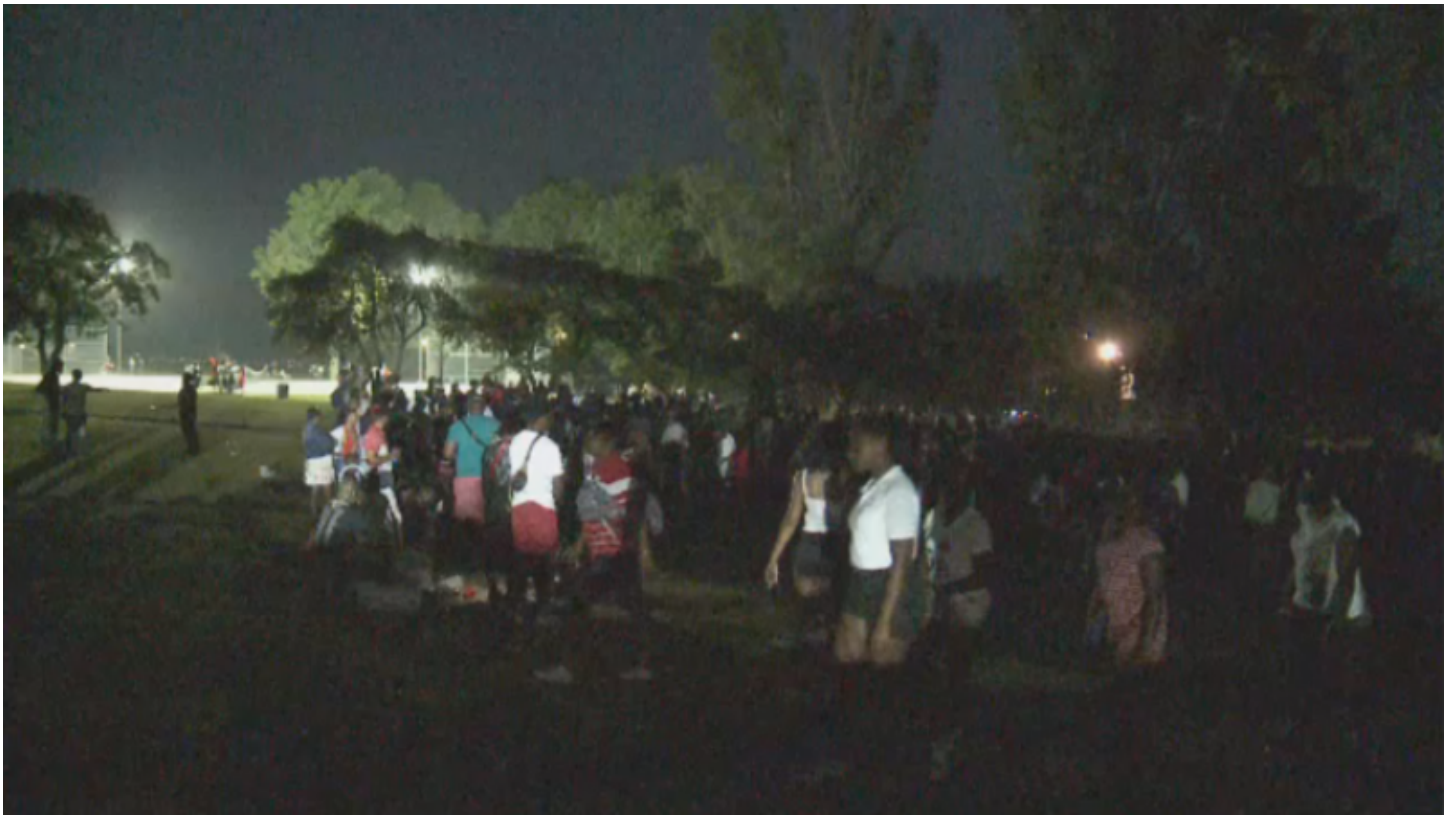
Police called in to shut down Canada Day celebrations at Mooney's Bay