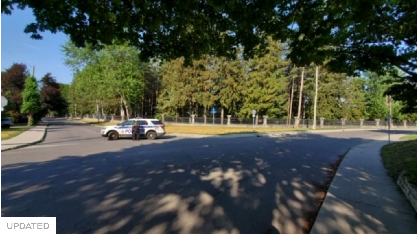
'Situation' at Rideau Hall resolved after RCMP investigation