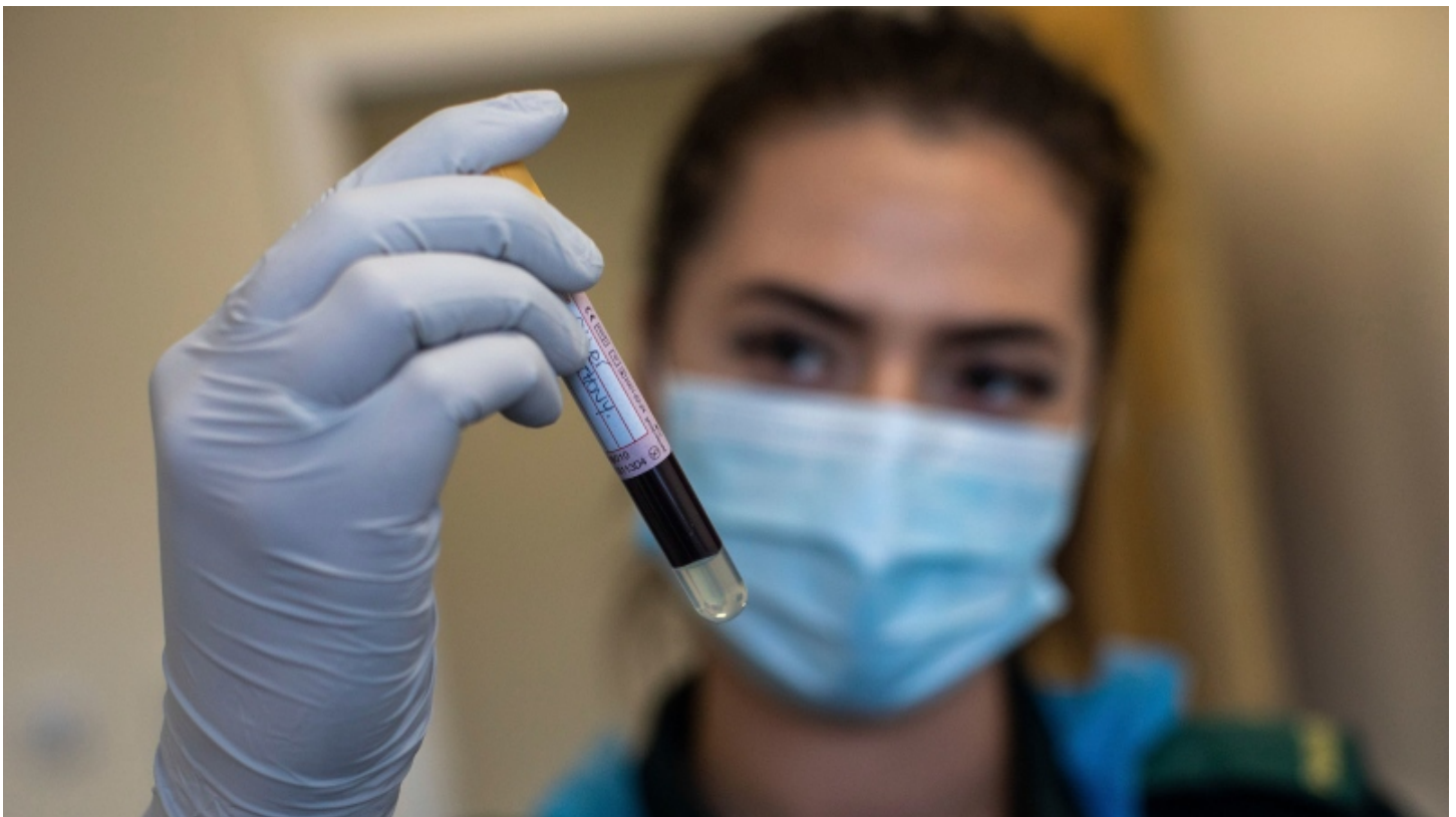
Canadian-led research casts doubt on accuracy of COVID-19 antibody tests