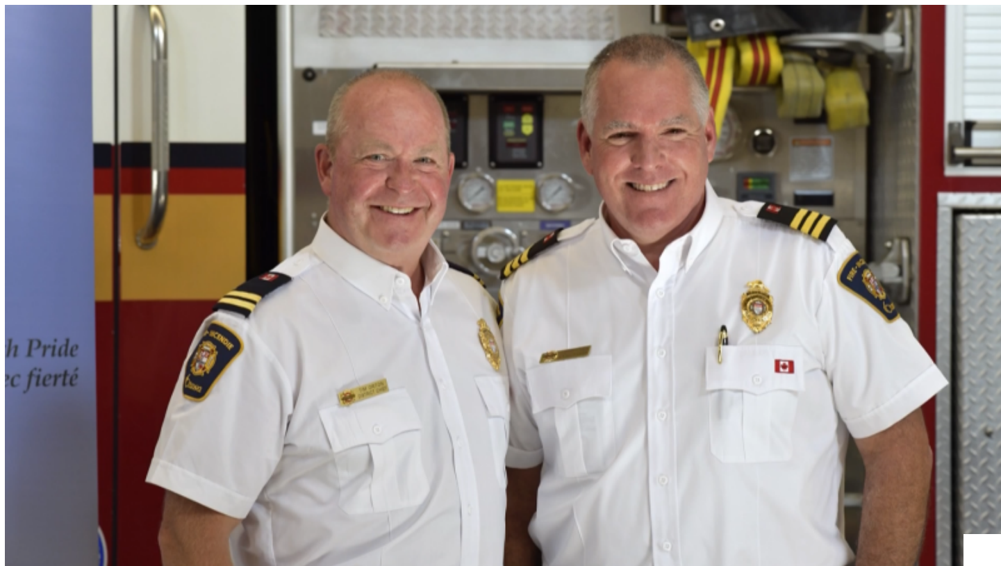
Firefighters and friends hang up their helmets after 37 years