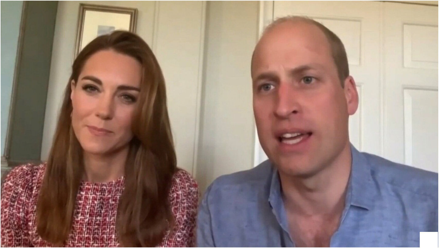
Duke and Duchess of Cambridge thank B.C. hospital workers