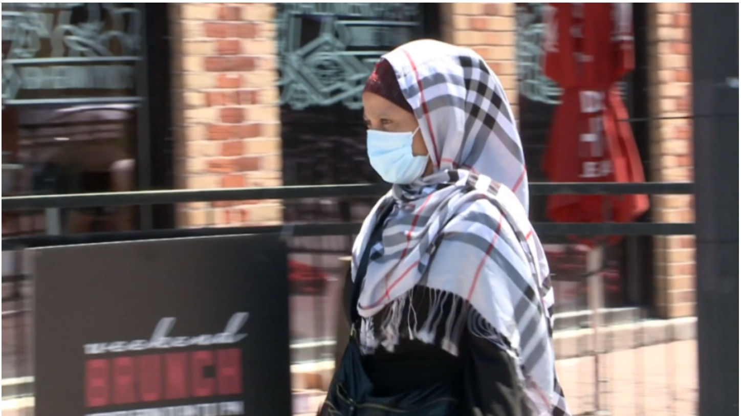
Eastern Ontario Health Unit set to make masks mandatory in area from Prescott-Russell to Cornwall, Hawkesbury