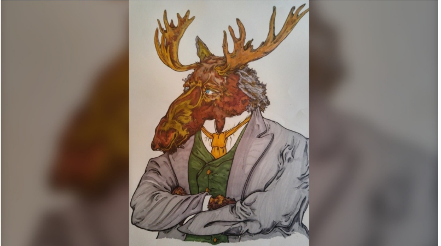
Portraits of prime ministers as Animals: An Ottawa Artist and Pet Industry worker creates a 'Countdown to Canada Day'