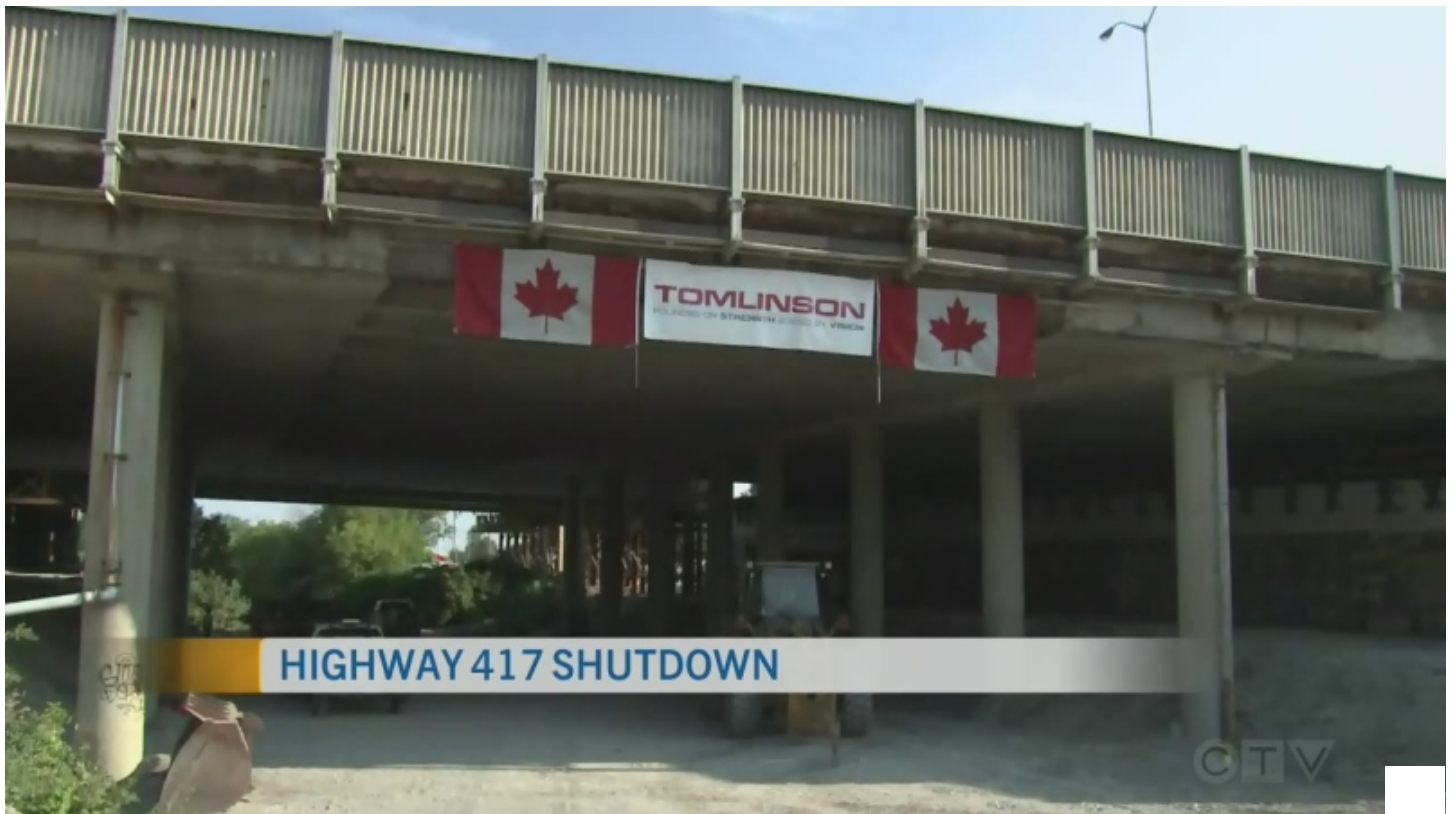
Highway 417 Shutdown