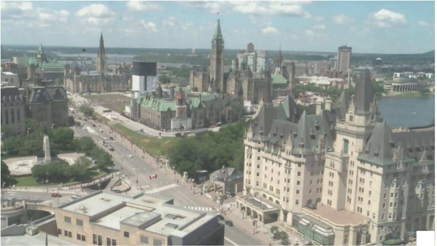
Canada Day in Ottawa