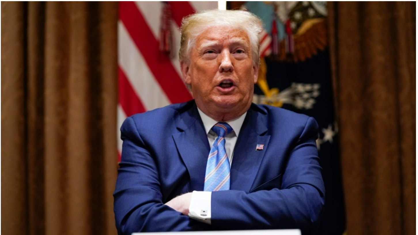
Trump says he thinks coronavirus is 'going to sort of just disappear, I hope'