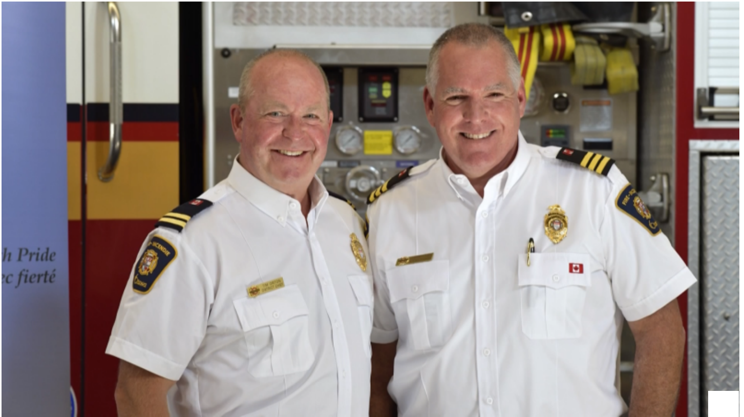
Firefighters and friends hang up their helmets after 37 years