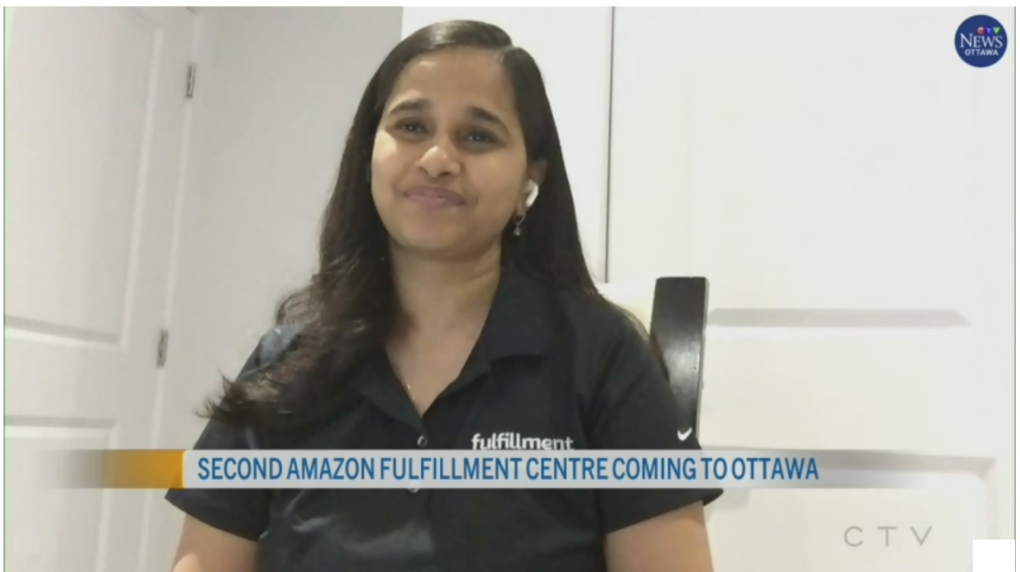
Second Amazon Fulfillment Centre Coming To Ottawa