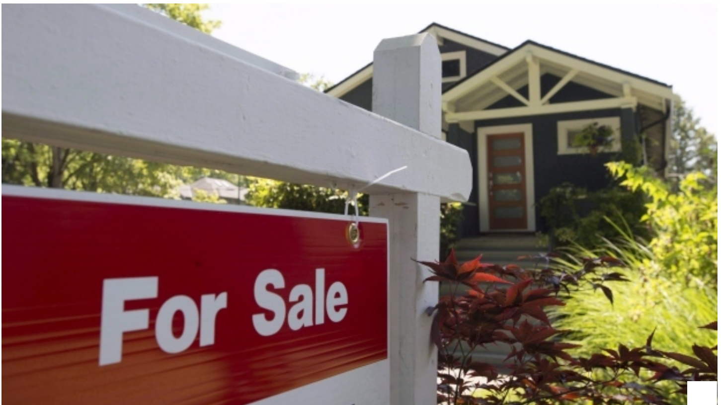
Attention home buyers: CMHC tightens mortgage lending rules