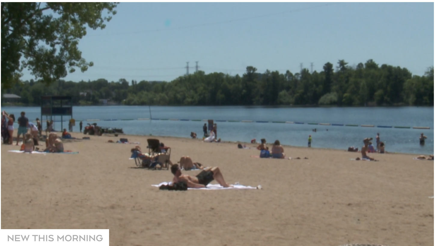
Heat warning issued for Ottawa