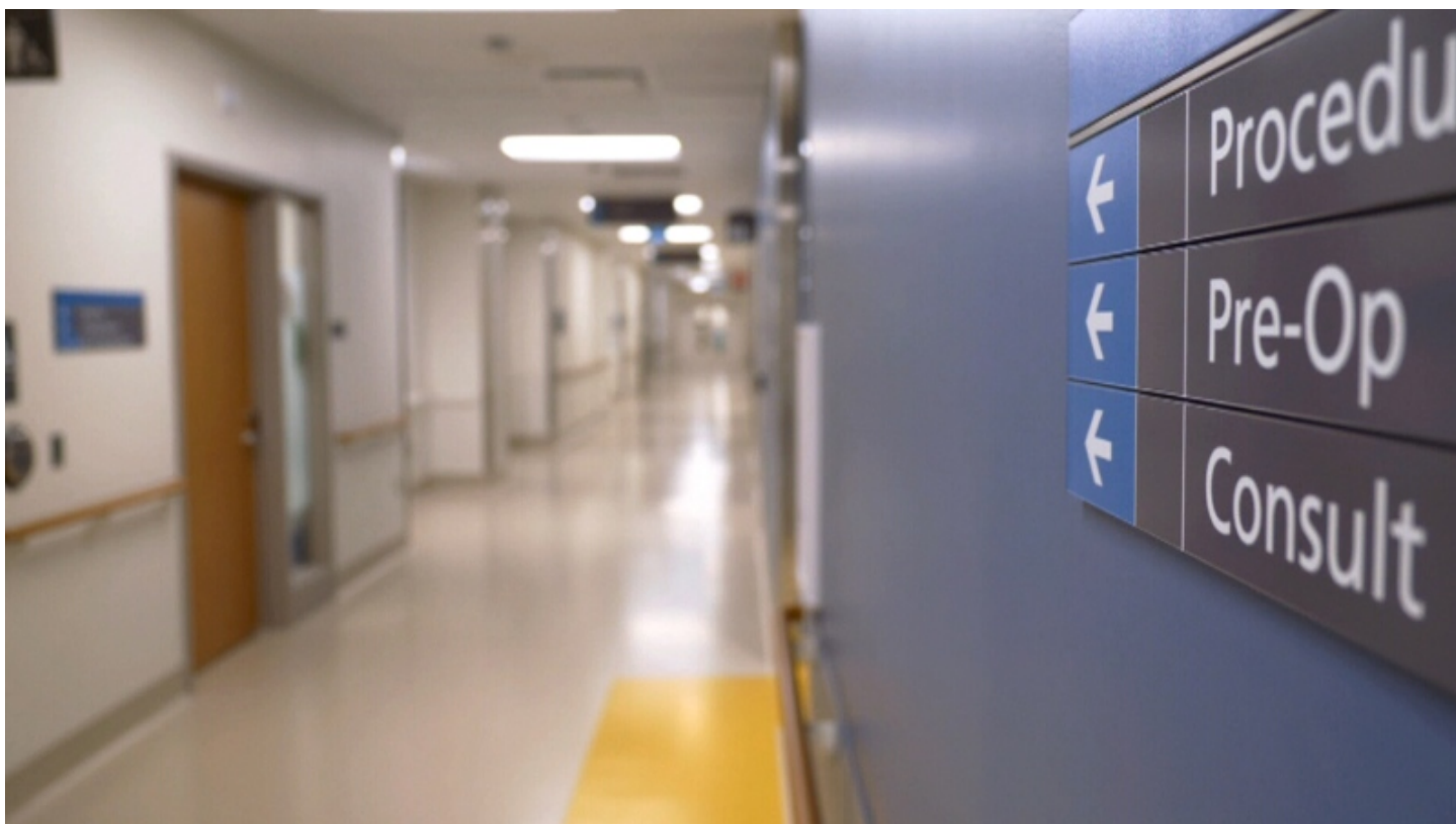
How a hospital group is preparing to resume elective surgeries after COVID-19 turmoil