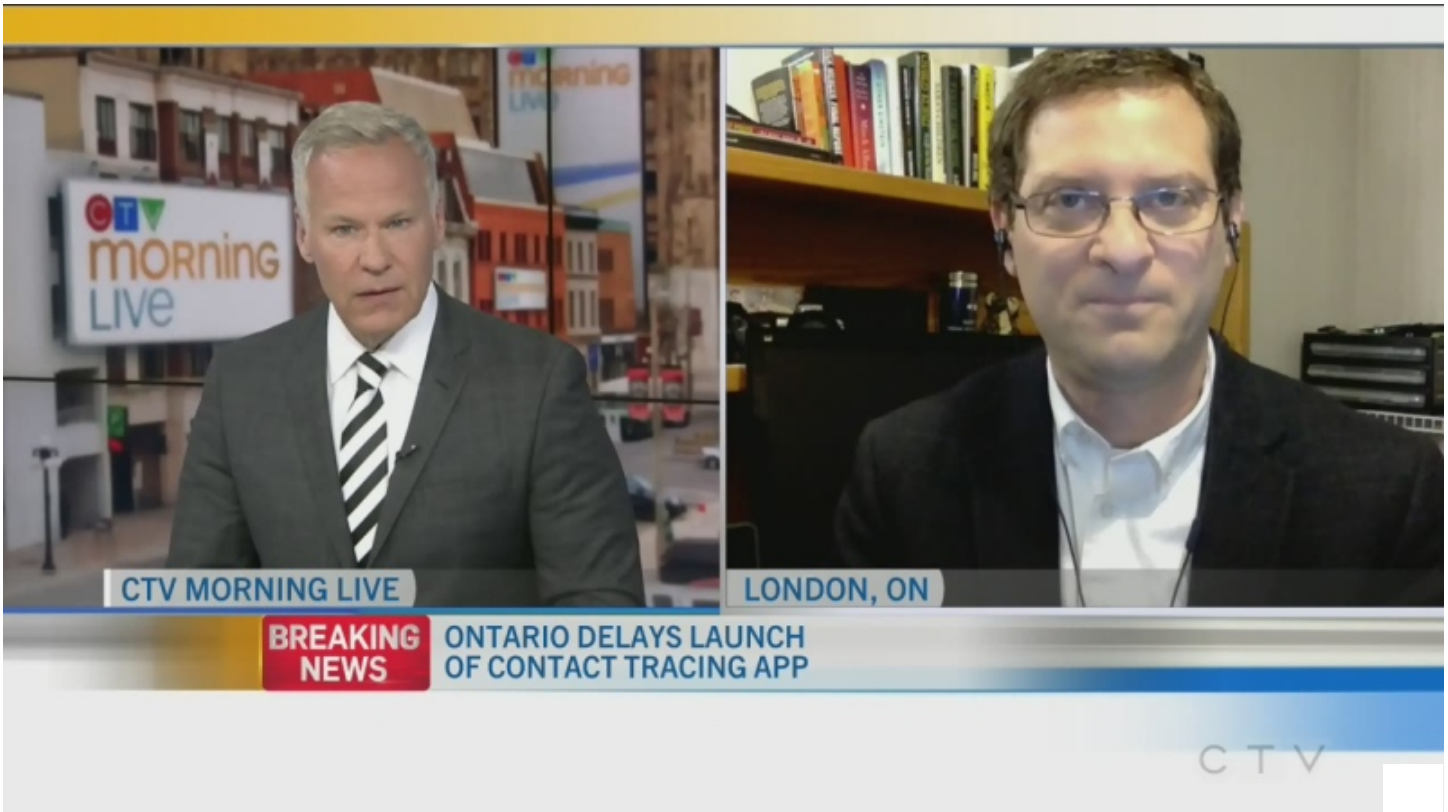
Ontario Delays Launch Of Contact Tracing App