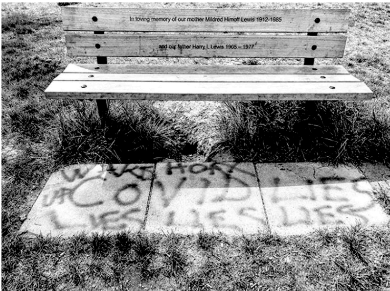
Figure 9. A rudimentary and no-less political scrawl on a slab of concrete in a park setting reading “Wake up, Hoax, COVID, Lies Lies Lies Lies” (punctuation added for conveyance).