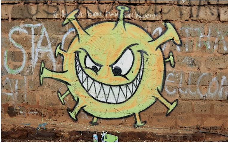
Figure 2. The virus is depicted with anthropomorphic characteristics.