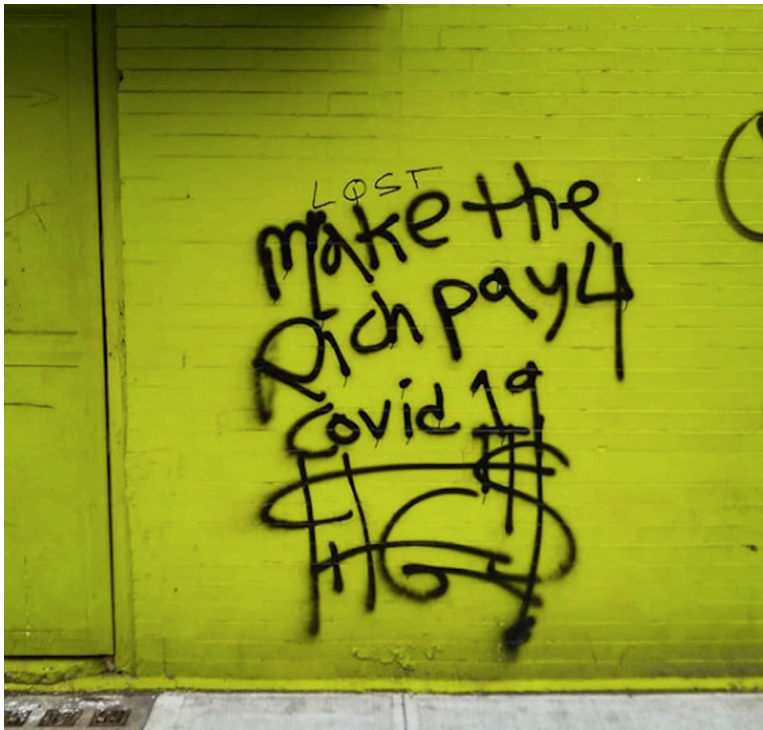
Figure 3. A rudimentary message reading "Make the Rich Pay 4 COVID-19," followed by a cryptic signature.