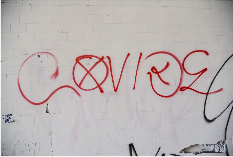
Figure 8. The word “Covide” reveals a standard and well-executed Los Angeles-based and iconic gang-graffiti style judging by the use of the traditional E, inner line of the D, and crossed-out O.