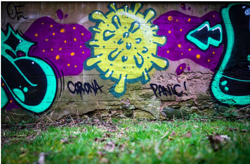
Figure 1. Depictions of the virus have been produced on walls around the world. The image depicts the virus within a graffiti production accompanied by the message "Corona Panic."

Walls are where people have looked for centuries to gauge public reactions to and personal perspectives on major events that cannot be left to those in power to convey. This is true in times of war, peace, protest, and revolution (Lennon, 2014) and is evidently no-less true in the time of COVID-19.