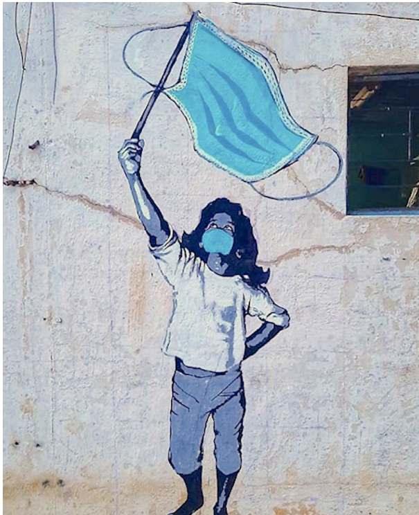
Figure 13. The street art stencil composition evokes the ubiquity of the face mask as a prophylactic to be worn to slow the spread of the virus.