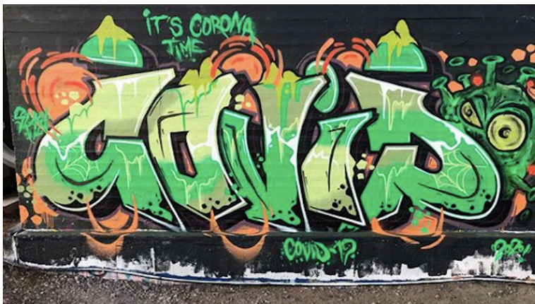
Figure 11. Graffiti writers have taken to the walls with COVID-19 providing the inspiration for both the production of font and imagery. This “COVID” piece contains all of the conventions of advanced graffiti art in terms of color schemes, fill-ins, highlights, and balance.