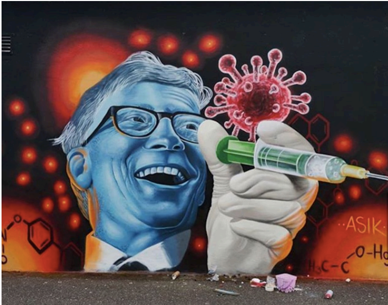
Figure 12. Street artists have likewise taken to the walls with intricate and expertly-crafted imagery. The image depicts Bill Gates in the midst of the COVID-19 outbreak with what is presumably an inoculation for the disease within a syringe.