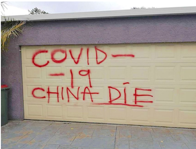
Figure 5. A political statement unproblematically and violently linking COVID-19 to its reported Chinese origins. “COVID-19 China Die” is depicted here in a way that is legible, putting the emphasis on the simplistic scrawl and message. Its placement on a private residence illustrates the producer has no affiliation with the graffiti community for whom writing on single family homes is not practiced.