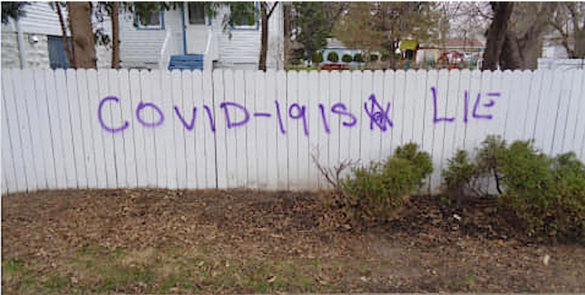
Figure 6. Similar to the message in Figure 5, here is a simplistic scrawl on a residential property with an allusion to conspiratorial perspectives on COVID-19 given both the message, “COVID-19 is a LIE,” as well as the use of the Freemason symbol as the letter A. Conspiracies have ranged from attributing COVID-19 to the effects of the 5G network, to the belief that governments concocted a COVID scare in order to divert attention away from the building of the 5G network’s infrastructure.