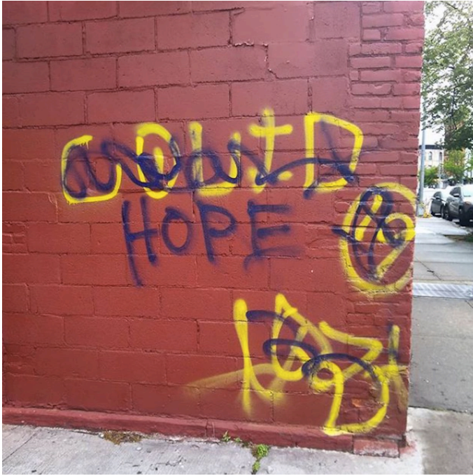
Figure 4. A “COVID-19” tag contested by the word “Hope.” The COVID writing appears to be by someone with basic knowledge of graffiti conventions as exemplified by the dotted O and exhibited can control. Whereas the “Hope” is inexpertly written, its producer follows the tradition of crossing out, or “lining” to show disapproval, disrespect, or express a direct challenge.