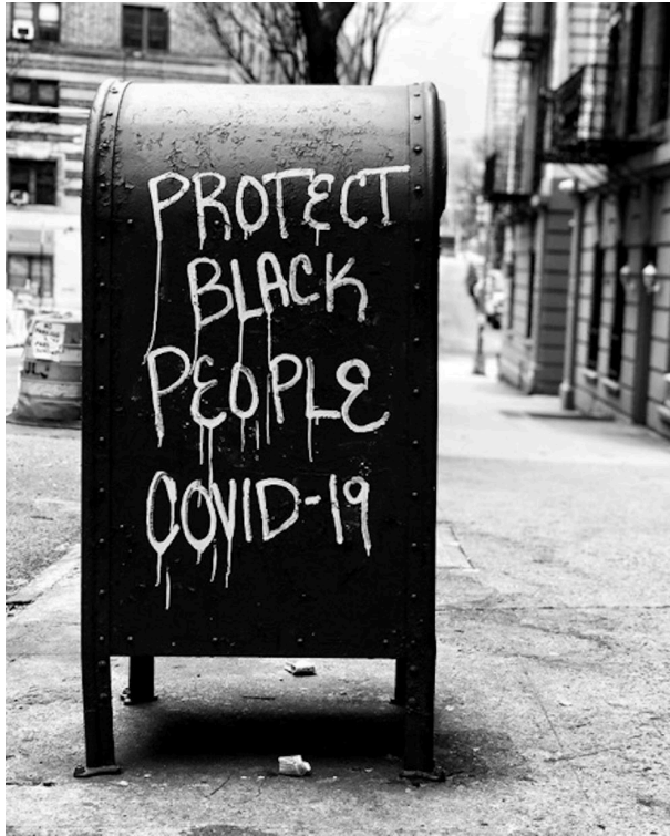
Figure 10. Evoking the disproportionate infection and death rates experienced by the Black community in the United States, the message of “Protect Black People COVID-19” makes use of a mail box as platform and “dripper” marker as implement, both of which reveal a basic knowledge of so-called “hip hop graffiti” composition and tactic.