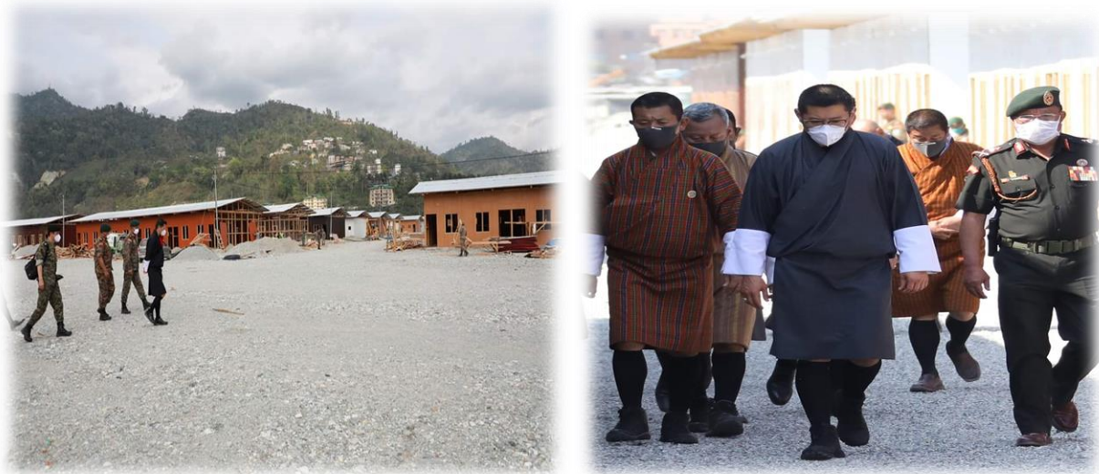
Figure 2: His Majesty on tour to southern dzongkhags

times. Religious bodies led by His Holiness the Je Khenpo have also played a significant role in keeping the disease at bay.