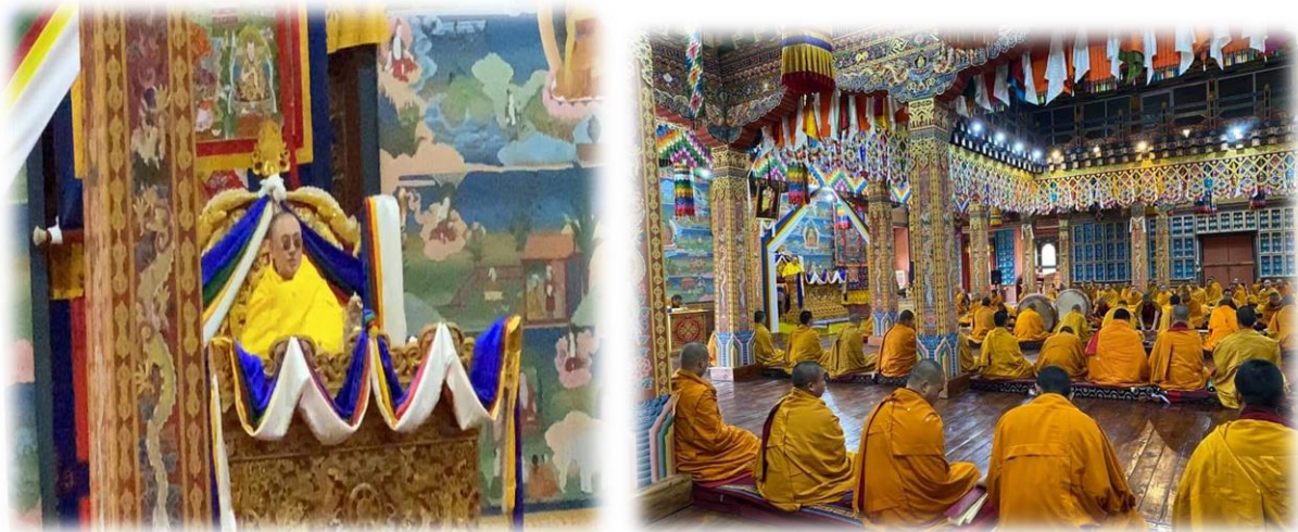
Figure 3 Monastic body presided by Je Khenpo