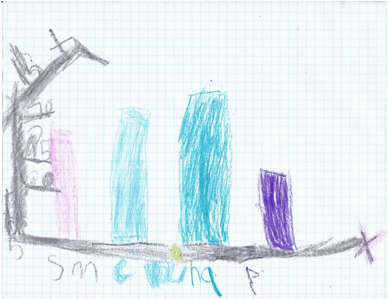
Yet another figure of rating of sources.