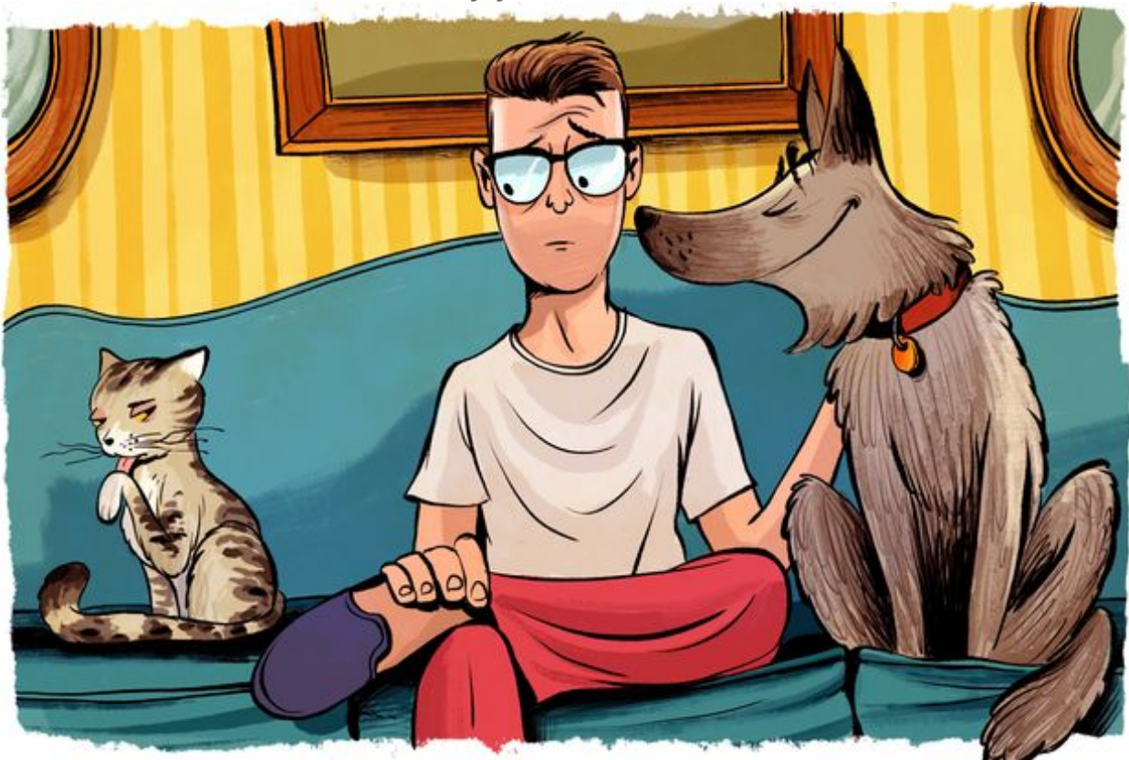
ILLUSTRATION: ZOHAR LAZAR

You think this decision is strictly yours. It's not.