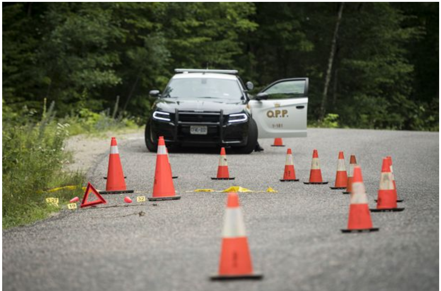
Police markers near the home of a 73-year-old man who was fatally shot by officers, in the area of Eagle Lake, by the village of Haliburton, Ont., are photographed on July 16, 2020.