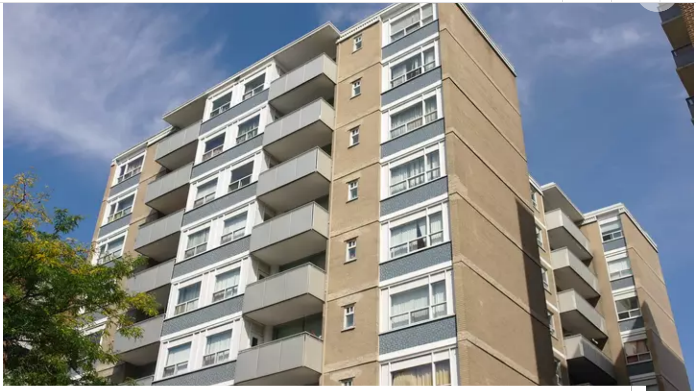
Here's what you can do if you can't make next month's rent in Toronto