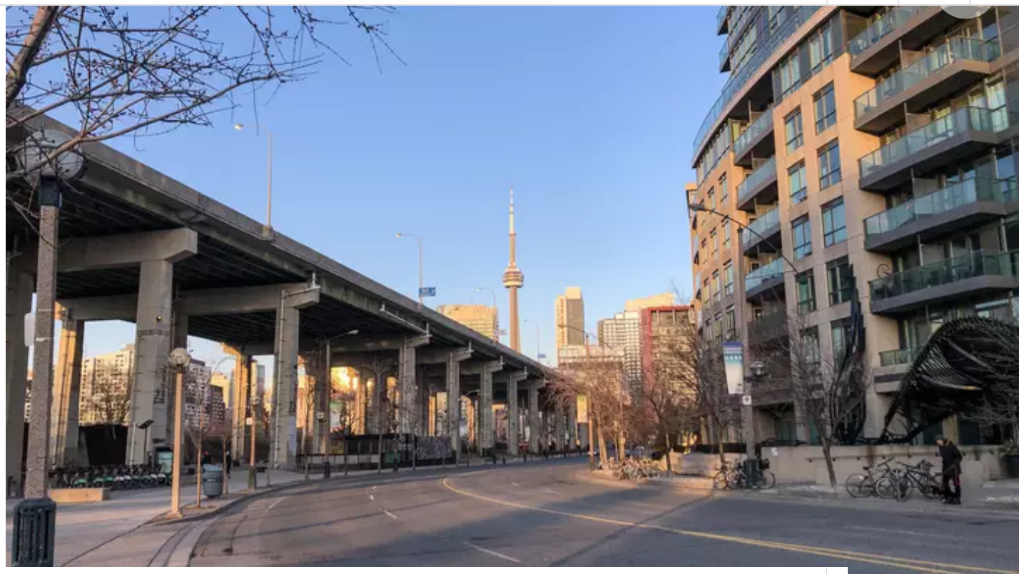
Rent and condo prices fall in Toronto as pandemic takes its toll