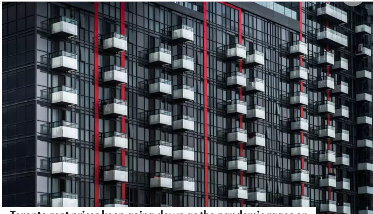
Toronto rent prices keep going down as the pandemic rages on