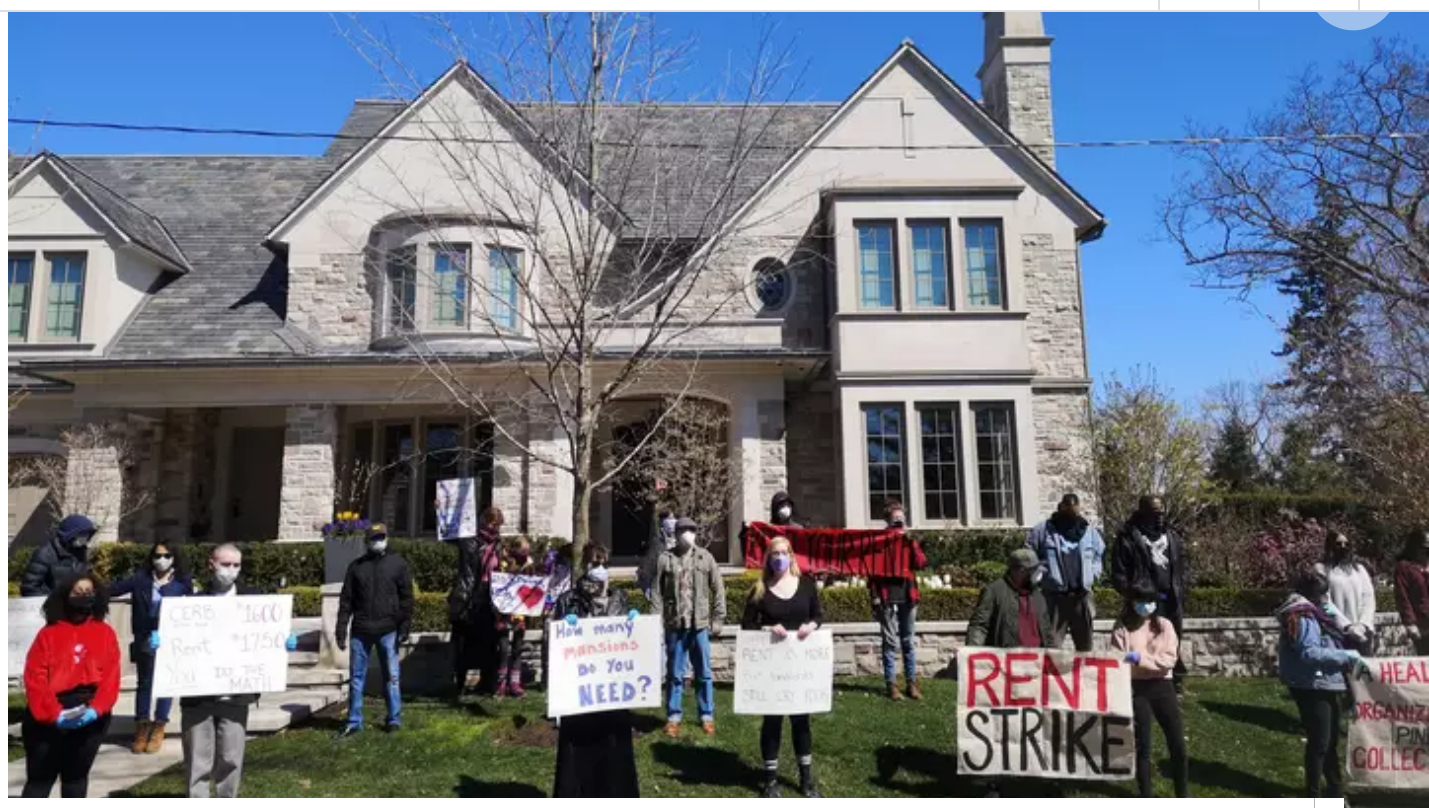
Toronto renters are now staging protests outside the mansions of their landlords