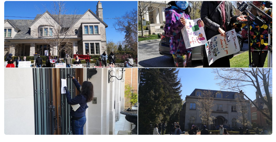
507 12:57 PM - May 13, 2020

Tenants demanded no evictions and rent forgiveness for tenants unable to pay rent during #COVID19