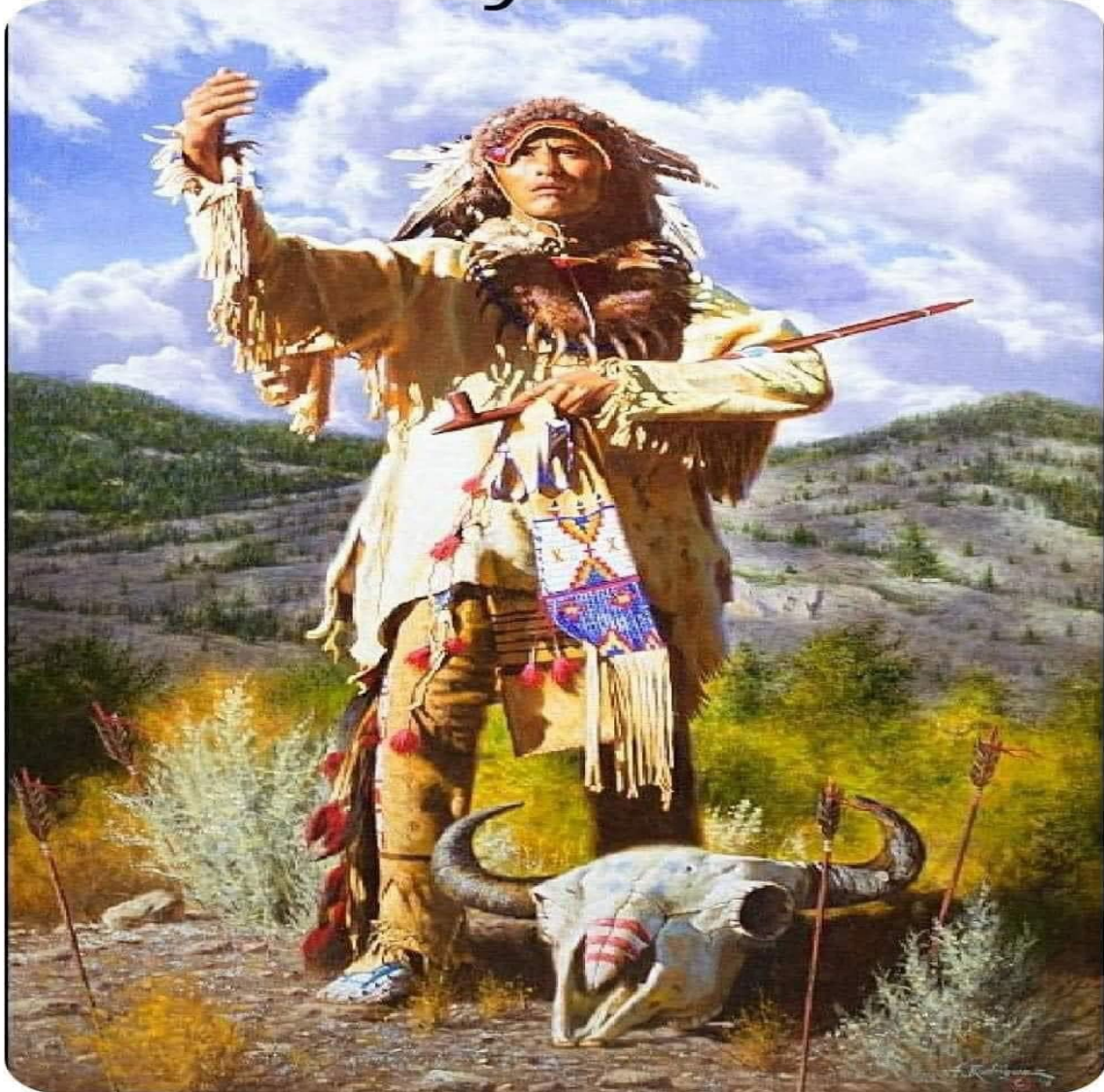
(1&2 Pre Columbian America)

I'd like to acknowledge that I am on my own land